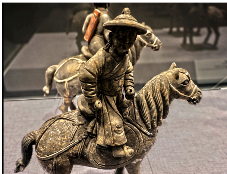
Figure 8. Front view (with reflected back) of a ceramic figure of a postal courier unearthed from Xiadian Village, Chang'an District, Xi'an, Shaanxi Province, China. Yuan dynasty. H. 37.5 cm, l. 32 cm. Collection of the Shaanxi Provincial Institute of Archaeology.