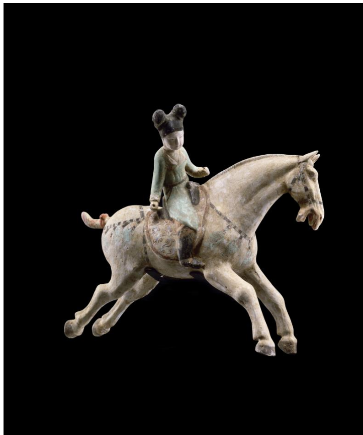
Figure 4. Young woman polo player. Tang Dynasty, first half of the 8th century. Painted unglazed ceramic. Musée Guimet. MA 6117.