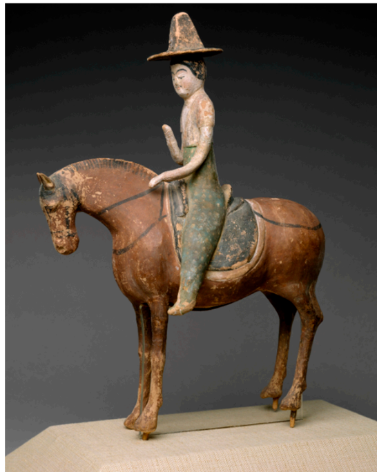
Figure 3. Horse and female rider. Tang dynasty (618–907), 7th century. Astana cemetery, Xinjiang province, China. Unfired clay with pigment. H. 36.2 cm, L. 29.2 cm. Metropolitan Museum of Art, New York, Fletcher Fund, 1951 accession number 51.93a, b.