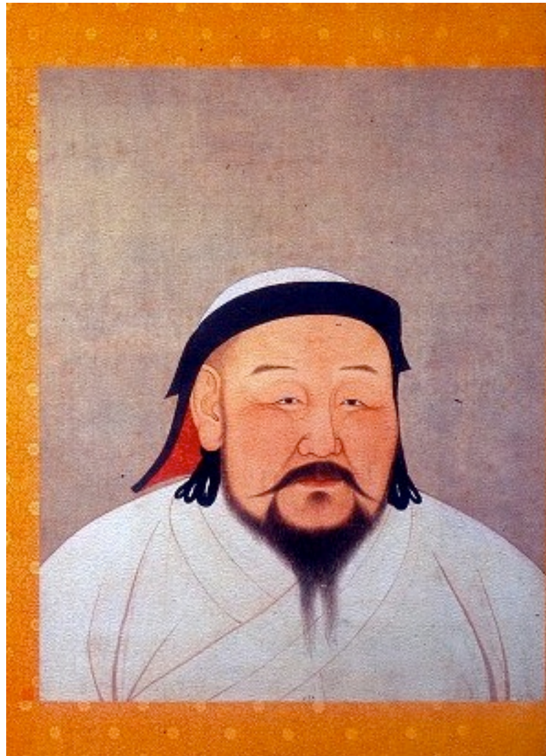
Figure 9. Anige (1245–1306), Portrait of Kubilai . 1294, Yuan dynasty. Album leaf, colors and ink on silk. Height: 59.1; width: 47.6 cm.

more significant, perhaps, is the presence of these postal road couriers in the first place in this tomb, no matter their gender. Wang Shiying and his wife were connected to the higher ranks of the Mongol government. Perhaps the depiction of postal workers in the funerary context represented some of the lived experiences of people in the Yuan dynasty or served as a reminder of Wang's official position in the administration, just as ceramic figures of men and women playing polo may have represented a version of reality in the Tang context. Most polo players and postal couriers were men, but the ceramic figures of women performing these roles may have been a way of taking delight in the spectacle of women doing physical activities normally associated with men, especially in the Chinese context.