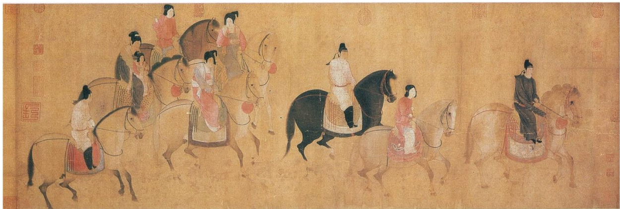
Figure 5. Song Dynasty copy (by Song Emperor Huizong?) of Tang origin attributed to Zhang Xuan (713–755), Lady Guoguo's Spring Outing . Hand scroll, ink and colors on silk. 52 × 148 cm. Liaoning Provincial Museum.