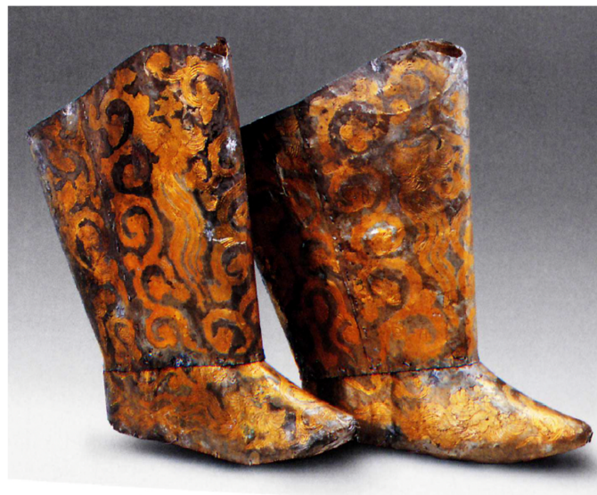
Figure 7. Pair of boots, tomb of Princess of Chen and Xiao Shaoju, Qinglongshan, Naiman Banner, Inner Mongolia. Liao dynasty, ca.1018. Gilded silver, L. 29.2 cm, H. 37.5 cm. Research Institute of Cultural Relics and Archaeology of Inner Mongolia. After Kinoshita 2006, cat. 4.

(Pearson et al. 2019, p. 58). As with the Yemaotai burial, the deceased seems to have been interred with favored objects she used in life. Unlike the Princess of Chen and Yemaotai burials, which date from the Liao imperial period, the woman in the Üzüür Gyalan burial lived in Mongolia prior to the confederation of groups by Chinggis Khan and the subsequent establishment of the Mongol Empire. In other words, she did not live in an imperial system. The objects in her tomb are of good quality, but none are made of expensive materials such as gold or silver, and many of the garments and other textiles show that they were worn and repaired (Pearson et al. 2019, p. 58). The horse interred with the deceased was likely a favored one she rode in life (Pearson et al. 2019, p. 58). The horse buried with the tomb occupant parallels the favored polo donkeys interred with Madame Cui in Tang Chang'an mentioned above, although the context is quite different. The Üzüür Gyalan burial features a favored horse that the deceased rode to do daily tasks, while the polo donkeys in Madame Cui's tomb are among many luxury possessions that give us insight into the leisure activities of the deceased. As for hunting, while horse riding was an important activity for the woman buried in Üzüür Gyalan, none of the burial objects found in her tomb indicate that she was a hunter.