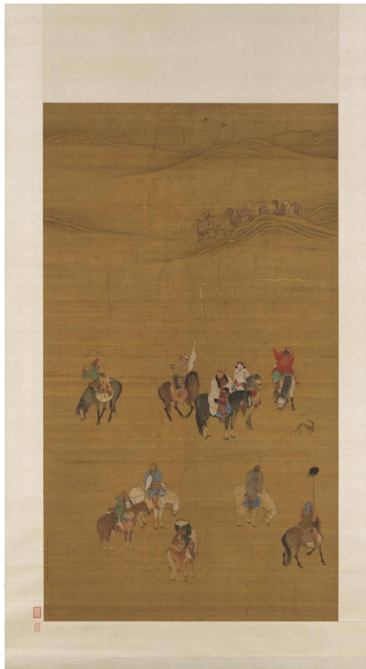
Figure 6. Liu Guandao (active ca. 1275–1300). Kubilai Khan Hunting , dated 1280. Hanging scroll, ink and color on silk. 182.9 cm × 104.1 cm.

This paper approaches women's roles in the hunt in the Liao and Yuan dynasties together for several reasons. First, the Kitan and the Mongols were nomadic groups originating from present-day Mongolia for whom horse riding was an essential part of daily life, and as such, they share certain cultural characteristics. In addition, when the Kitan established the Liao, pre-imperial Mongol groups lived contemporaneously with the Liao dynasty in parts of Mongolia, and the material evidence from different places in north China and Mongolia provides useful comparisons. Finally, the Liao provided an important precedent for Yuan rule in China, impacting everything from the societal structure to dress (Morgan 1982, p. 129; Shea 2020, pp. 13, 22–31, 42). Although the Liao dynasty in China fell to the Jurchen Jin in 1125, members of the ruling Yelü family fled to Central Asia under the leadership of Yelü Dashi, where they established the Qara Khitai, or Western Liao. The Qara Khitai did not fall until the Mongol conquests in that region in 1218, and