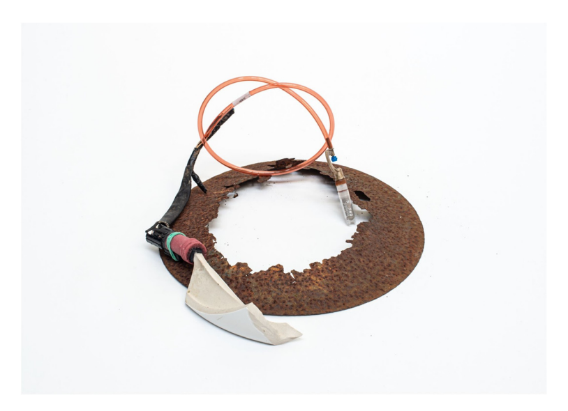
Figure 14. Matthias. 2022. Clean-Up Workers VIII (Deluxe Series). H 10 cm H, 44 cm L, 30 cm W. Rusty metal ring, cast glass, found objects and dust.

Clean-Up Workers V (Deluxe Series) (see Figure 15) is currently an unresolved piece. Originally, the cleaner was supposed to hang from a stand/docking station, but on photographing the work, I discovered the anthropomorphic nature of the composition was dominant, so the piece now lies on its side; there is a suggestive eye latch feature. V also has a gear stick cover sac filled with debris, which is attached to respirator packaging that looks like a urinal but also suggests the inhalation of dust if fitted over the mouth. The ceramic cavity is filled with a sponge.