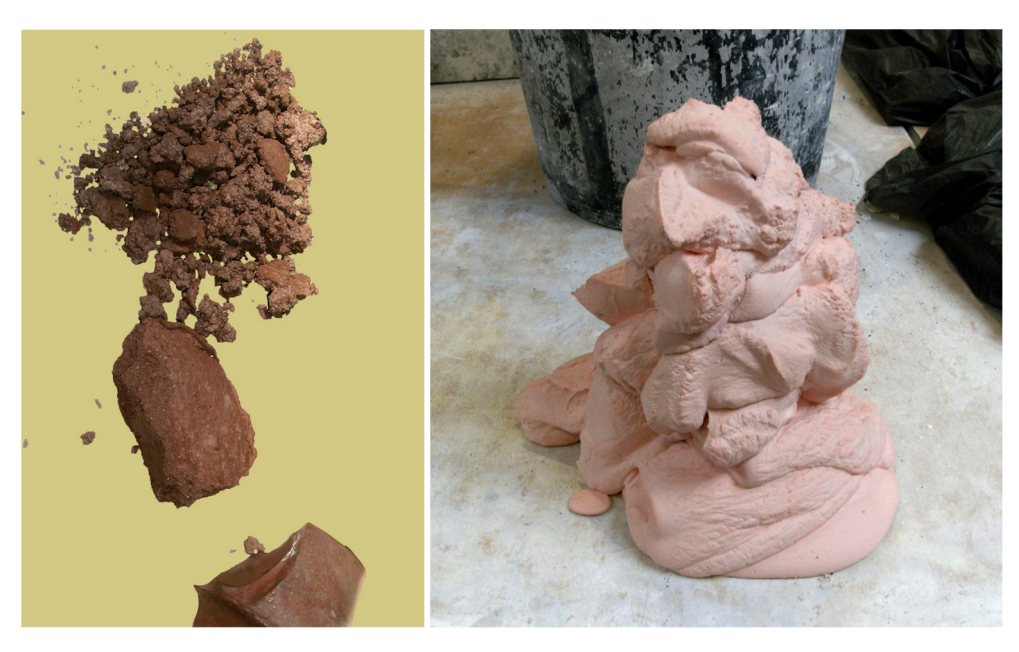
Figure 1. By-product objects or materials from a creative practice. 2023

and we extend the demand for cleanliness to the human body too' (Freud 2014, p. 43). Through my sculptures, I want to address waste aesthetics and aspects of disorder and, hence, the threat presented by waste.