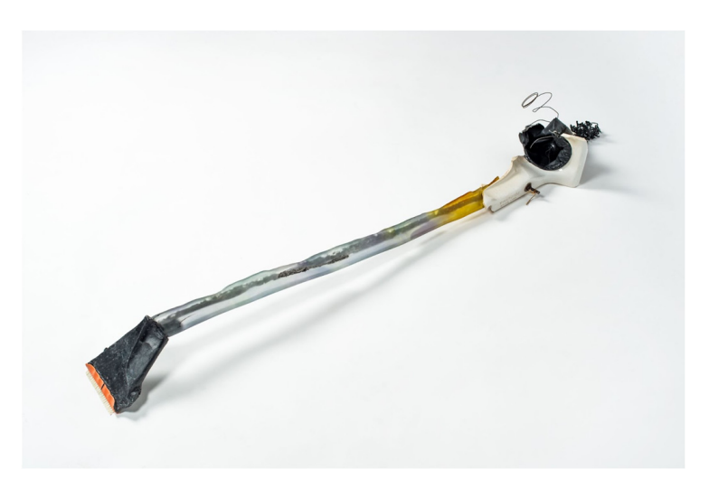
Figure 11. Matthias. 2022. Clean-Up Workers III (Deluxe Series). 13 cm H, 136 cm L, 21 cm W. Cast glass, found objects, steel strap and swarf.