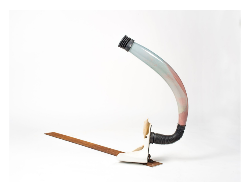
Figure 12. Matthias. 2022. Clean-Up Workers IV (Deluxe Series). 82 cm H, 128 cm L, 22 cm W. Blown glass, sheet steel and found objects.

In Clean-Up Worker VII (Deluxe Series) (see Figure 13), the red car filter takes on the role of an architecturally moulded picture frame. It also provides a fleshy, plush, undulated landscape for the urine-coloured cast glass organ to rest on (a nod to the piss bottles). The cabling intrudes beyond the boundary of the frame in a similar way to the trompe l'oeil painting of 19th-century realist painter Pere Borrell del Caso's most famous work, Escaping Criticism (1874). The cabling is held together by a cast bronze replica of a plastic toy arm that I found on a beach that has a threatening or defiant fist. It speaks of the threat of 'you must clean your room' or 'I shall not clean my room, what a waste of time'.