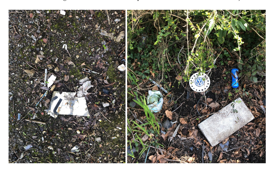
Figure 4. Images of non-places and found objects, Orchards Scrap Yard Car Park, Cornwall, UK.

They are, therefore, places that can be abused through vandalism, careless dropping of waste, or places where waste accumulates (see Figure 4). Because these places appear to belong to everyone, they belong to no one, they are, in some instances, inaccessible. Road verges or central medians are places where waste materials and objects come to rest.