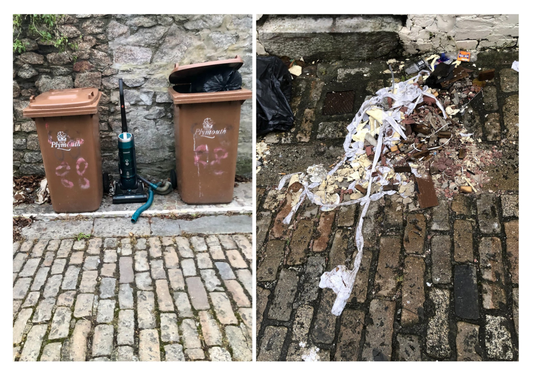
Figure 3. Refuse still life photographs, Plymouth, UK. 2023

Implements/appliances used to control waste in a domestic arena—scrapers, brushes, and vacuum cleaners—are my current preoccupation. They can be found in back streets by rubbish bins along with the usual fly-tipping standards of broken sofas and DIY remnants. These sorts of abandoned items can be left for weeks as the refuge collectors refuse to dispose of them, but eventually, they are removed from sight. I regularly take photographs of these 'refuse still lifes' (see Figure 3).