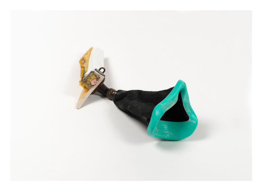
Figure 15. Matthias. 2022. Clean-Up Workers V (Deluxe Series). 14 cm H, 39 cm L, 20 cm W. Fabric, cast glass, found objects and Jesmonite.

Clean-Up Workers V (Deluxe Series) (see Figure 15) is currently an unresolved piece. Originally, the cleaner was supposed to hang from a stand/docking station, but on photographing the work, I discovered the anthropomorphic nature of the composition was dominant, so the piece now lies on its side; there is a suggestive eye latch feature. V also has a gear stick cover sac filled with debris, which is attached to respirator packaging that looks like a urinal but also suggests the inhalation of dust if fitted over the mouth. The ceramic cavity is filled with a sponge.