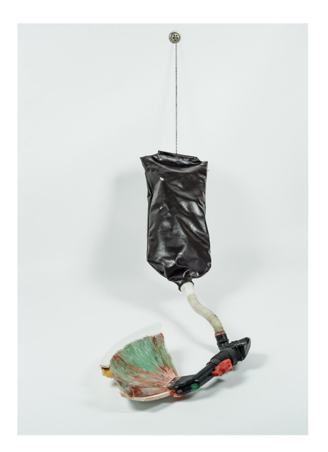
Figure 10. Matthias. 2021. Clean-Up Workers II (Deluxe Series). 125 cm H, 132 cm L, 72 cm W. Leatherette, plug hole cover, sheet glass and found objects.

The central component, the cleaning devices, are staged and framed to contextualise their meaning and create a window into another world, a mise en scene, or 'a bounded space of representation' (Scanlan 2005, p. 92). Each tableau that supports the Clean-Up Workers is disintegrating, beyond repair and beyond surface cleaning or treatment. They operate on a micro-macro level, and they are internal and external. They also provide a rim and an 'objet petit a' that cannot suffice. Cleaning will never be fulfilling as it never ends.