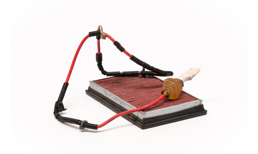
Figure 13. Matthias. 2022. Clean-Up Workers VII (Deluxe Series). 21 cm H, 32 cm L, 29 cm W. Cable, cast metal, cast glass and found objects.

In Clean-Up Worker VII (Deluxe Series) (see Figure 13), the red car filter takes on the role of an architecturally moulded picture frame. It also provides a fleshy, plush, undulated landscape for the urine-coloured cast glass organ to rest on (a nod to the piss bottles). The cabling intrudes beyond the boundary of the frame in a similar way to the trompe l'oeil painting of 19th-century realist painter Pere Borrell del Caso's most famous work, Escaping Criticism (1874). The cabling is held together by a cast bronze replica of a plastic toy arm that I found on a beach that has a threatening or defiant fist. It speaks of the threat of 'you must clean your room' or 'I shall not clean my room, what a waste of time'.