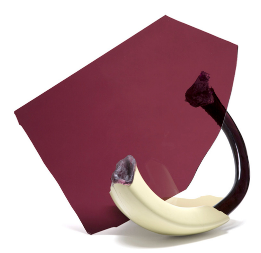
Figure 6. Matthias. 2012. Anatomical Deconstruction VI. 50 cm H, 40 cm L, 53 cm W. Sheet glass, cast glass and found object.

and 2014. This abstracted work economised on materials and visual language. The broken edges of the smashed ceramics could be interpreted as another form of Lacan's 'rim'—they possessed mouth-like orifices. The glass casts that I created from the negative spaces inside the sink became alternative plugs.