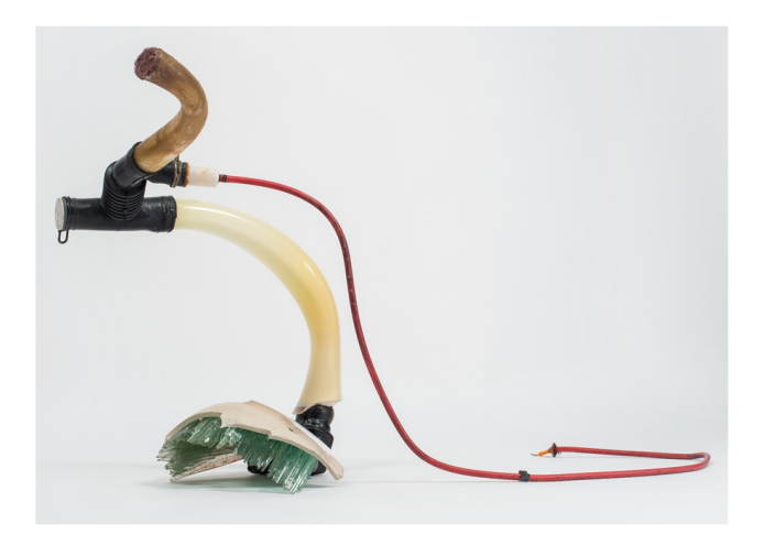
Figure 9. Matthias. 2021. Clean-Up Workers I (Deluxe Series). 63 cm H, 161 cm L, 30 cm W. Blown glass, found objects, sheet glass and wax.

Clean-Up Workers I (see Figure 9) has two glass pipes; the shorter one forms a handle covered in sticky wax with a pink scourer feature, and the larger, translucent, cream 'wind tunnel ultra-grip rod' contains dust and sediment. There is a tiny toothpick/flossing head attachment (found by the side of the road) at the end of the red cable for those difficult-to-reach nooks and crannies that suggest obsessive cleaning. A ploy that I use is to contrast the intricate with larger components as this 'suggests an ambiguity of scale from the intimate to the monumental' (Haigh 2014, p. 67).