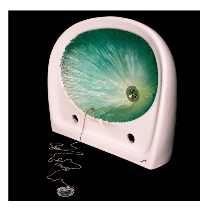
Figure 5. Matthias. 2007. Sink and Plug, 43 cm H, 46.5 cm L, 15 cm W. Found object, sheet glass and cast glass.

With 'Sink and Plug' (see Figure 5), I wanted to isolate and draw the audience's attention to the plughole portal by lining the receptacle of an old sink with roughly cut sheet glass. The glass served multiple purposes: as a signifier of danger, an acknowledgement of the act of plugging and an exaggerator of the internal organ-like quality of the sink bowl, now possessing a striated ridged muscular lining of glass. However, the sheet glass, when assembled, no longer possessed the threat of the individual shard; placing the plug in the plughole would not result in an anxious, raised heartbeat as anticipated.