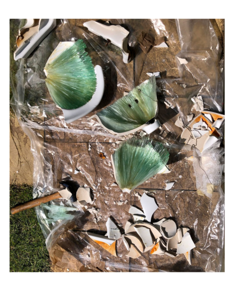
Figure 7. Photograph of broken 'Sink and Plug', 2021.

archaeological diagnostic fragments of potsherds that will lead to minute inspection. They also suggest the stages of the return to dirt discussed by Douglas.