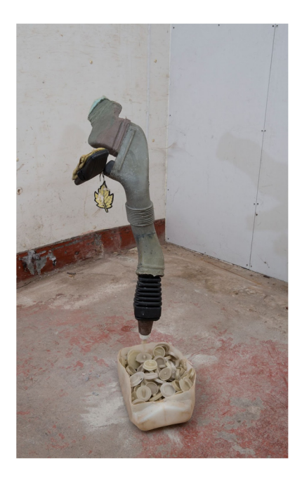
Figure 8. Matthias. 2016. The Os Coxa Diaphragm Chamber 142. 87 cm H, 80 cm L, 33 cm W. Wax, steel armature, found objects.

became luxe and luxure in French, with meanings that preserved the distinctions of the original Latin. The French word luxe developed the meanings that we commonly associate with luxury : "wealth" and "indulgence." The French phase de luxe , meaning "of luxury," became the English word deluxe ' (Merriam-Webster.com 2016).