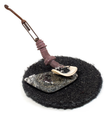
Figure 17. Matthias. 2023. Clean-Up Workers IX (Deluxe Series). 26 cm H, 38 cm L, 30 cm W. Found objects, silver, cast glass and broken mirror.

For Clean-Up Workers IX (Deluxe Series) (see Figure 17), I used a vulnerable protrusion of the car, the discarded wing mirror, which is an indicator of some kind of collision, a misjudgement by the driver. It is an abandoned object; smashed mirrors tend to be located by roadsides, particularly on narrow lanes, and they can be difficult to find. The mirror is also of interest as it allows the driver to see outside of peripheral vision to blind spots. I was reading about Lacan's notions of the mirror phase in a child's psychological development, the point at which the child first recognises a distinction between itself and the (m)other, the point at which it also begins an understanding of space, distance and position. The wing mirror is almost a reverse textural composition to the cushioned dirty scourer that it sits upon, though there is something glitzy about the mirror ball effect that I find captivating; it elevates the scoop on a disco podium. The scoop contains the debris from cutting and filing the black plastic back of the mirror in order to engineer the top-heavy composition. The opaque lilac cast glass mimics plastic or innards. It has a mouth-like opening that is lined with silver wire, out of which spews the waste. This waste is another form of 'objet petit a', analogous to consumerism, that momentary satisfaction through acquisition or expulsion.