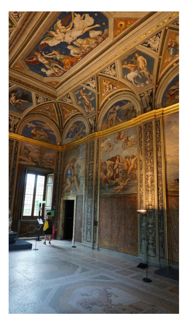
Figure 12. Raphael's Triumph of Galatea (1511–12) and Sebastiano del Piombo's Polyphemus (1512) in the Loggia of Galatea.

meant empathize and perhaps even find humor in the patron's self-effacing confessions of failed love. Painted soon after Peruzzi completed his ceiling fresco, these murals build on and strengthen the poetic metaphor of the petrified lover.