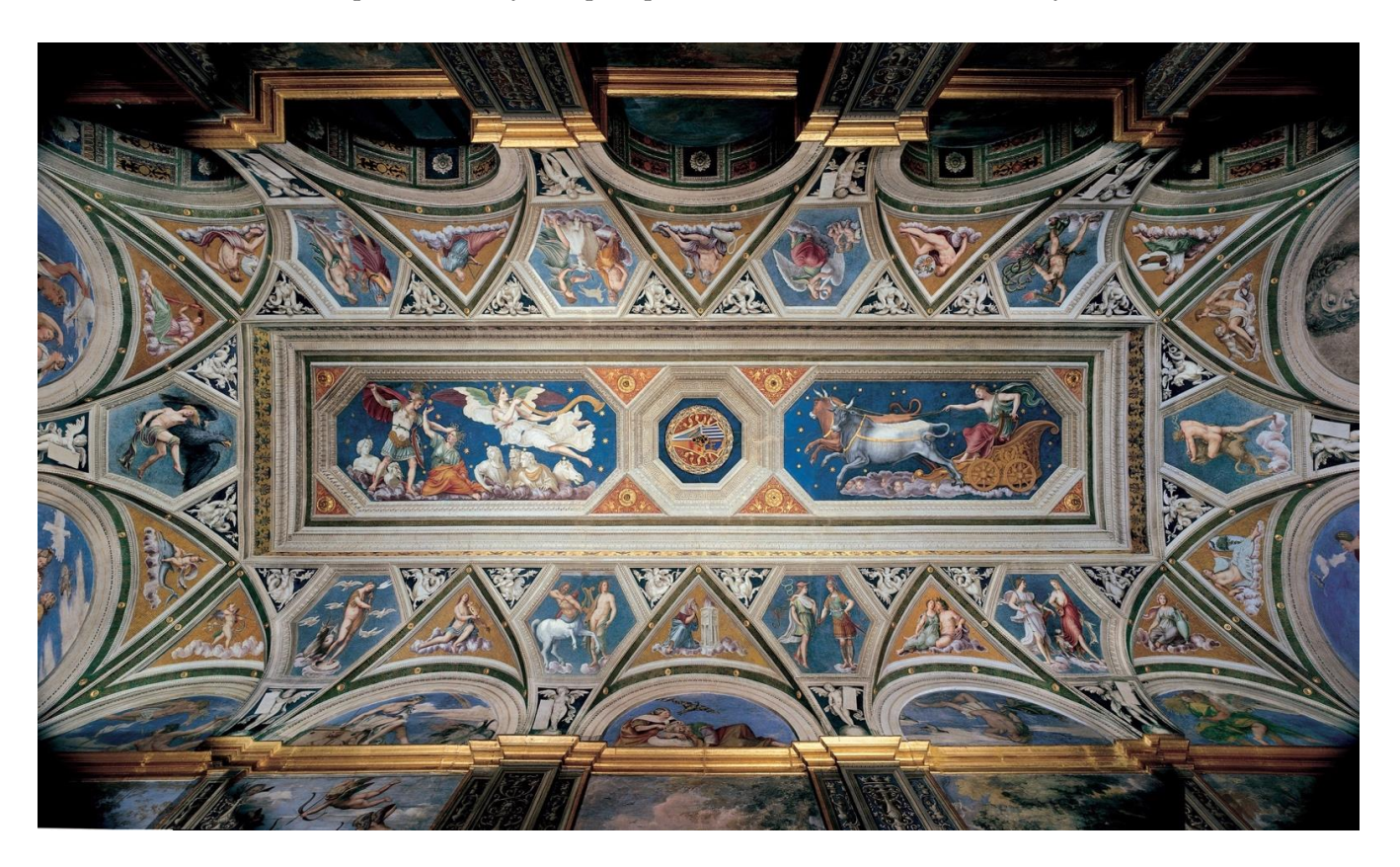
Figure 5. Baldassarre Peruzzi, vault fresco in the Loggia of Galatea, 1510–11. Villa Farnesina, Rome, Italy.

of planet-deity plus zodiac symbol therefore indicates specific orbital positions of those planets as they occupied particular zodiacal houses in the sky.