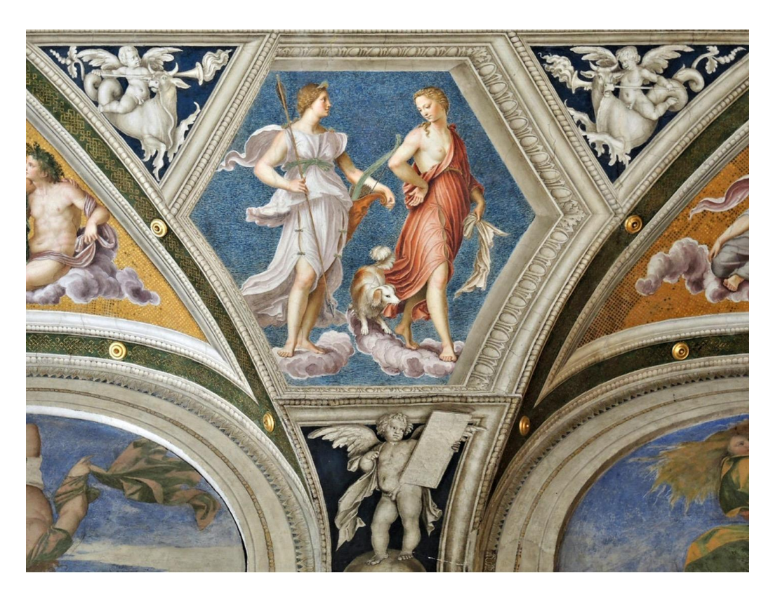
Figure 3. Baldassarre Peruzzi, Virgo with Diana, detail from the vault fresco of the Loggia of Galatea, 1510–11. Fresco painting, Villa Farnesina, Rome, Italy.

material work of art. In examining that encounter taking shape within a distinct spatial context, I will argue that Renaissance artists like him not only understood the semantic powers of the material substances that comprised their works, but they also considered the material presence of the viewer's body as an essential medium in constructing and activating their artwork.