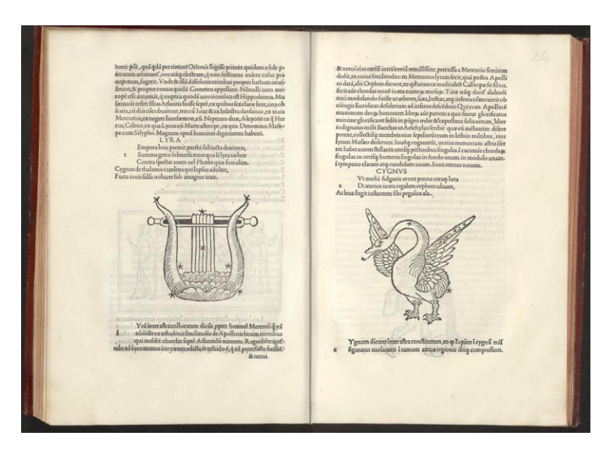
Figure 6. Aldus Manutius, Scriptores astronomici veteres (Venice, 1499), Rare Book and Special Collections, Library of Congress, Washington, D.C. [Incun. 1499 F57 QB41]. Image in the public domain.