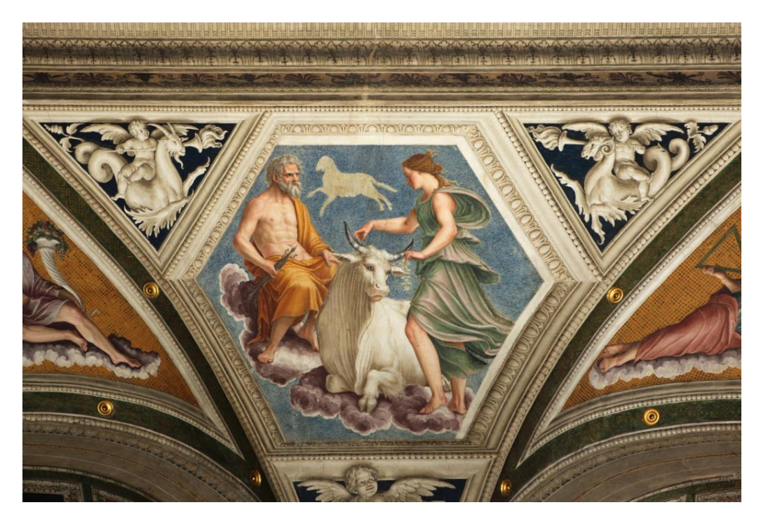
Figure 11. Baldassarre Peruzzi, Jupiter in the house of Taurus, detail from the vault fresco in the Loggia of Galatea.

scientific sources as well as sources on classical mythology. The fresco asks that one lingers, stares, and considers the imagery with care.