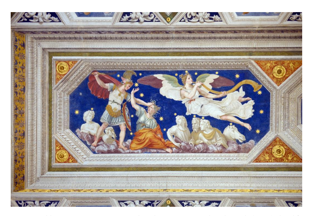
Figure 7. Baldassarre Peruzzi, Perseus and Medusa, Pegasus, and Andromeda (Fame), detail from the vault fresco in the Loggia of Galatea. © SCALA/Art Resource, NY.

To represent stellar bodies in a vault fresco like this was not unusual in the Italian context. The night's sky is a recurring decorative motif in medieval and early modern art, and examples abound in the Byzantine tradition as well. The vault mosaic of the Mausoleum of Galla Placidia in Ravenna is one early instance from the fifth century. Much later, in the fourteenth century, Giotto (d. 1337) painted an eternal starry night with lapis lazuli and gold in the Scrovegni chapel in Padova (Figure 8). His eight-pointed stars symbolize the eighth day (eternity) and shimmer like gems in a jewel-box against the ultramarine background. Closer to Peruzzi's time and place, we may point to the original ceiling decoration of the Sistine chapel that Piermatteo d'Amelia (1445–1508) completed in 1481, decades before Michelangelo painted over it (Figure 9). The original Sistine ceiling