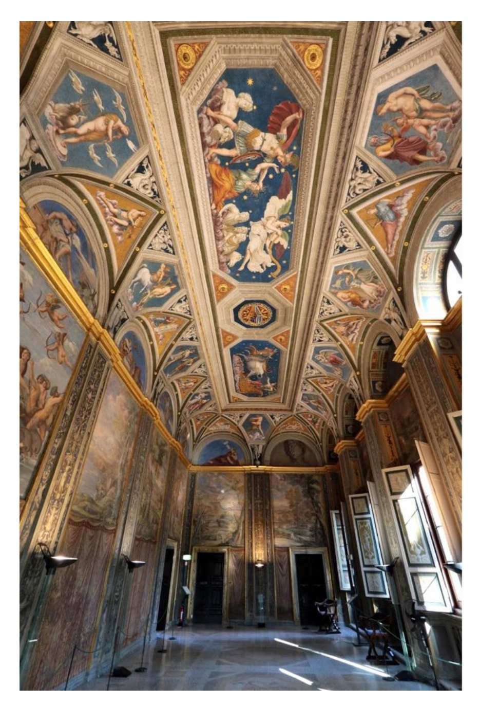
Figure 2. Loggia of Galatea, Villa Farnesina, Rome, Italy.

Vasari's anecdote is particularly valuable for the rare historical testimony it provides about the kinds of embodied encounters early modern viewers had with situated works of art. The story suggestively lays out the ideal mode of viewing for these types of paintings that are firmly fixed in place. Every beholder visiting the Loggia of Galatea is to empathize with Titian's experience, taken in initially by the awe-inspiring illusion whose admirable artifice is gradually revealed through physical motion and shifting points of view. Vasari clearly understands how the act of looking involves the body. Haptic viewing, or the viewer's material presence and movement through space, was crucial for the work to achieve its full effect. Renaissance artists like Peruzzi deliberately choreographed such viewing experiences, intentionally employing processes of haptic engagement to raise their audience's somatic experiences to the level of consciousness and to spark their imagination. Today we might call these communication strategies "interactive materiality." In what follows, I will explore the beholder's haptic encounter with Peruzzi's vault fresco as a