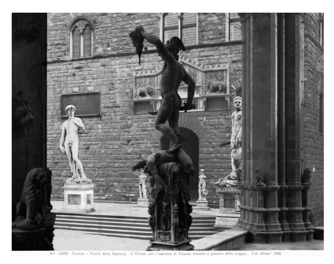
Figure 4. Benvenuto Cellini, Perseus and Medusa , 1545, bronze. Photography from 1935.