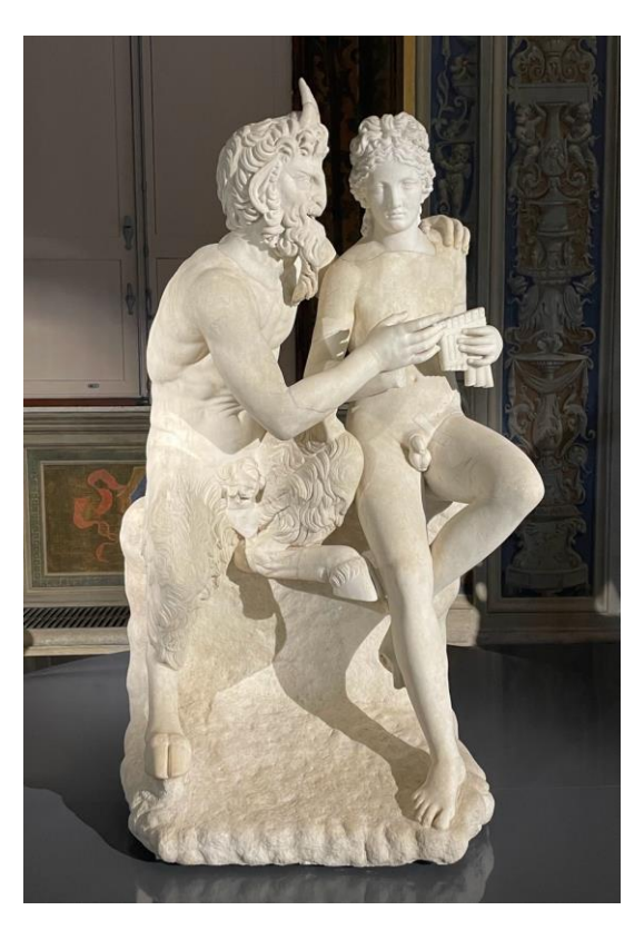
Figure 13. Pan Seducing Daphnis , 2nd century CE. marble, Museo Nazionale Romano Palazzo Altemps, inv. 8571, Rome. Formerly in Agostino Chigi's private collection.