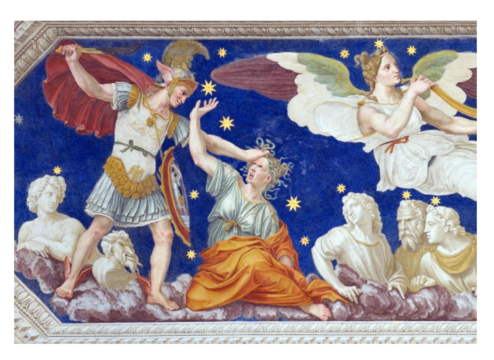
Figure 14. Baldassarre Peruzzi, detail from the vault fresco in the Loggia of Galatea.

The classical and contemporary works of art placed in and around the loggia, then, couch the patron's autobiography in mythological terms. Peruzzi's ceiling fresco provides the punchline of this inside-joke. The image of Perseus and Medusa suspended above at the summit of the hall against a starry background is meant to solicit a somatic consciousness in the beholder, petrifying and immobilizing their bodies as they shift their gaze to look