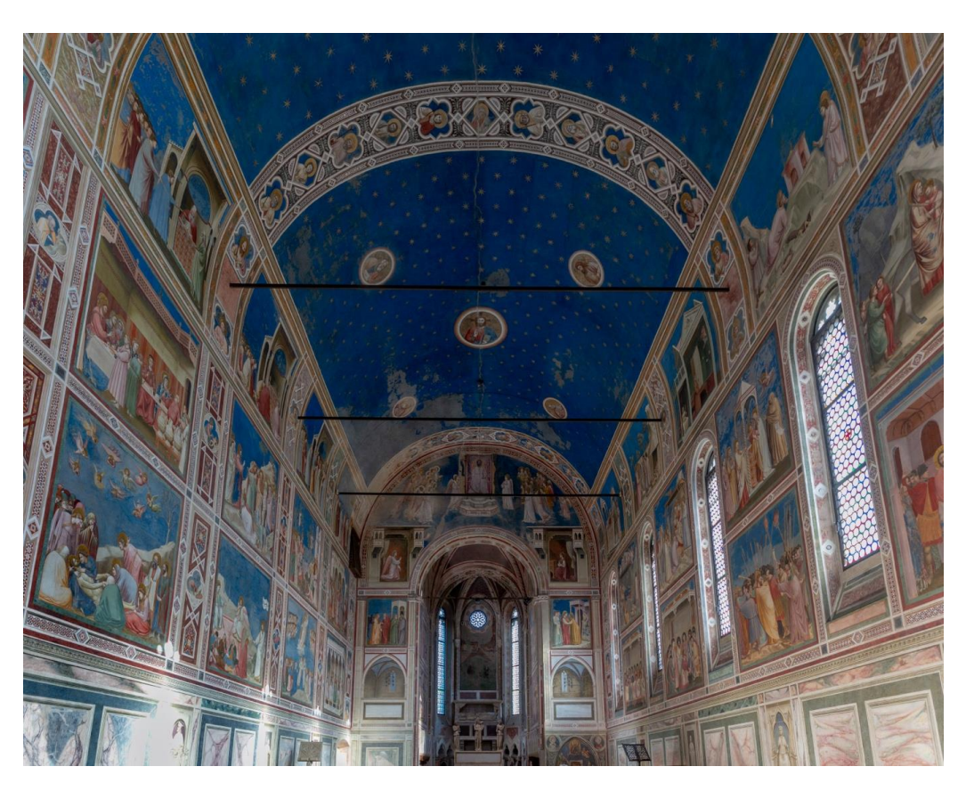
Figure 8. Giotto, Scrovegni Chapel, 1305. Padova, Italy. © Steven Zucker https://www.smarthistory.org. [Accessed 1 September 2023].

showed a starry sky in blue and gold, but unlike Giotto's chapel, its stellar bodies were arranged to reflect the visible material cosmos. As Florian Métral recently proposed, Piermatteo d'Amelia's pictorial cycle likely represented highly specific constellations such as Cancer, Leo, Virgo, and Libra that, together in their particular arrangement, showed the heavens visible in Rome on August 15th, the feast of the Assumption of the Virgin Mary to whom the papal chapel was dedicated.<sup>22</sup> Peruzzi's first recorded pictorial commission was a celestial vault fresco. Although the work is no longer extant, we know that the cupola he painted in 1502 in the chapel of Saint John the Baptist inside Siena cathedral was "entirely colored in blue, adorned with stars and the twelve signs of the Zodiac, in semi-relief and gilded."<sup>23</sup>