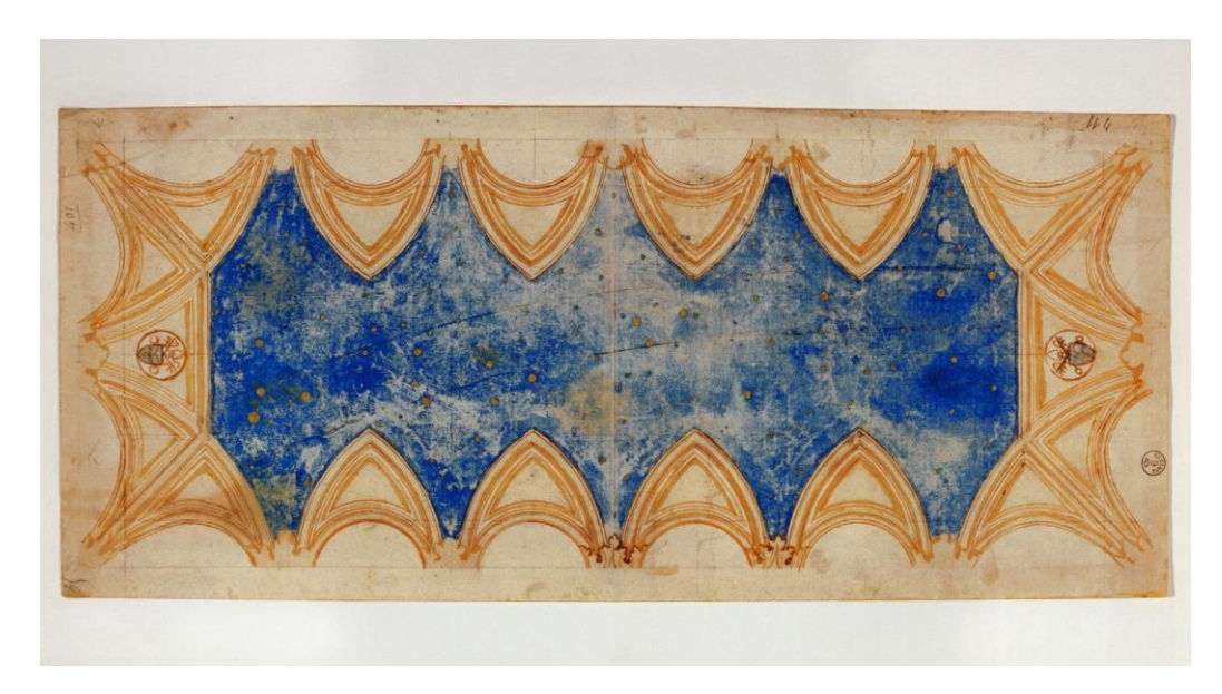
Figure 9. Piermatteo d'Amelia (attr.), Design for the Sistine chapel ceiling, ca. 1481. Gabinetto dei Disegni e delle Stampe, inv. 711A. Uffizi Gallery, Florence, Italy © SCALA/Art Resource, NY.