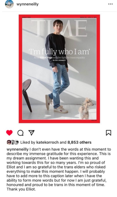
Figure 1. Screen grab of Neilly's Instagram feed captured by Ace Lehner on 16 March 2021.