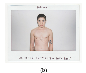
Figure 2. Cont.