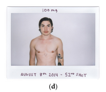
Figure 2. (a). August 30th, 2013—3rd shot, Polaroid photograph by Wynne Neilly, from Female to "Male"; (b). October 18th 2013—10th shot, Polaroid photograph by Wynne Neilly, from Female to "Male"; (c). January 24th 2014—24th shot, Polaroid photograph by Wynne Neilly, from Female to "Male"; (d). August 8th 2014—52nd shot, Polaroid photograph by Wynne Neilly, from Female to "Male".