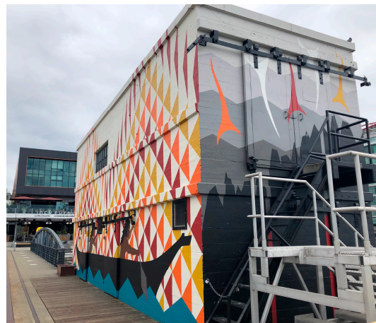
Figure 15. Debra Sparrow ʔəliχʷəlʷət (Musqueam), Aftermath , 2023.

the knowledgeable viewer the trigons appear similar to the long wooden pins used to hold a blanket in place, suggesting the healing power that weaving brings when wrapped around cold and damp bodies. Sparrow's Blanketing the City collaborator, Angela George, explains that "to blanket someone signifies a genuine embrace of love and protection" (George n.d.). The values of care and connection entwined in Salish weaving communities is communicated here. Sparrow also points out that "it is important to appreciate the irony of Indigenous people paddling across the inlet to risk their lives to rescue the people from a town that was systematically evicting Musqueam, Squamish, and Tsleil-Waututh people from their lands. This says a lot about who we are" ( Blanketing the City V n.d.). The sharing of blanket designs throughout the lower mainland as part of this project extends this practice of care into the public realm.