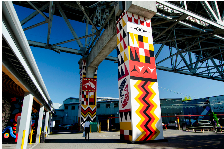
Figure 12. Debra Sparrow ʔəliχʷəlʷət (Musqueam), Blanketing the City 1 , 2018. Located on pillars supporting the Granville Street Bridge. Courtesy of the Vancouver Mural Festival.