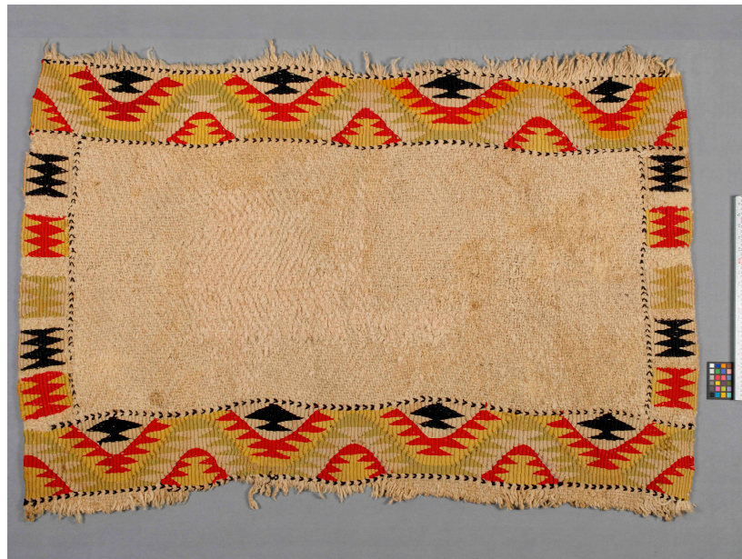
Figure 14. Chief's blanket. Made by Sp!aq!elthinoth. Worn by Chief Calpaymalt. Courtesy of UBC Museum of Anthropology, Vancouver, Canada, A1720.

On the narrow southern end of this same steel container, a darker scene reminds the viewer of the grim toll of that fateful day (Figure 15). Aftermath 's dark grey and black palette, illustrating the jagged silhouette of burnt buildings, is pierced with elongated orange, red, and yellow trigons emulating the flying sparks and embers of a dying fire. Debra Sparrow explains that she purposefully omitted beautiful weaving patterns from Aftermath , yet to