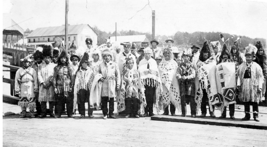
Figure 17. Chief Joe Capilano and delegation of First Nations leaders, May 1908. Chief Capilano stands just left of center with a woollen blanket draped over his arm. Also visible, pinned to his chest, is a medal from his 1906 visit to England to petition King Edward to seek justice for his people.

totem pole trail in Alaska, successful public art has the power to create opportunities to educate diverse populations, support economic growth for communities that have often been left out, and, perhaps most significantly for Indigenous communities, signal ongoing sovereignty in occupied lands.