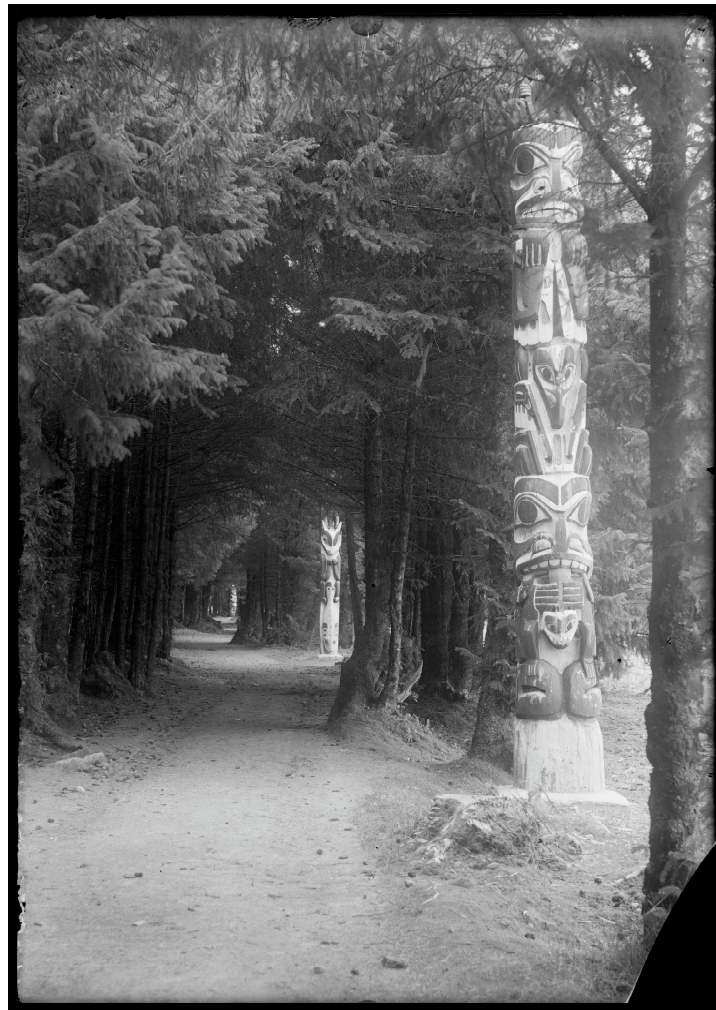
Figure 4. Elbridge W. Merrill, Totem Way at Sitka , 1906. The Haida pole in the foreground is one of a pair of house corner poles. It would have originally been located at an exterior corner of the Yaadaas clan house in Old Kasaan. Courtesy of National Park Service, Sitka National Historical Park; SITK 3822.

US government-led programs also utilized totem poles to entice visitors to Alaska, as tourist dollars were an important part of the developing economy, particularly for Indigenous people who were often displaced from or poorly paid in resource-based occupations. 8 In 1906, the same year the territorial capital moved to Juneau, Alaskan Governor John G. Brady added totem poles to an existing park in Sitka, which had been the capital of the territory since Alaska's purchase from Russia in 1867. Drawing on the good relationships he had formed with Indigenous leaders, between 1900 and 1903 Brady acquired at least nineteen poles from Tlingit and Haida communities throughout Southeast Alaska. These poles, along with two house fronts and a war canoe, were displayed at the 1904 Louisiana Purchase Exposition in St. Louis, Missouri, followed by the 1905 Lewis and Clark Centennial Exposition in Portland, Oregon (Jonaitis and Glass 2010, p. 84). These displays were intended to draw exposition goers to the Alaskan resource exhibits housed nearby, and ultimately entice settlers to Alaska to develop the territory (The Poles of Historic Totem Park n.d.). Upon the return of the poles to Alaska, resident photographer Elbridge W. Merrill was asked to place them at strategic points along idyllic forest paths (Figure 4), complementing the scenic and romantic vistas of the landscape surrounding Sitka (Moore 2018, p. 74).