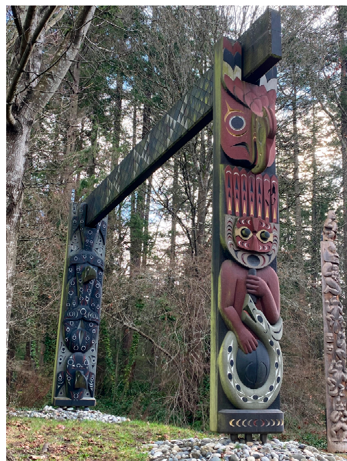
Figure 11. Susan Point (Musqueam), People Amongst the People: Salish Dancer and Whale , 2008. Salish weaving patterns adorn the crossbeam.