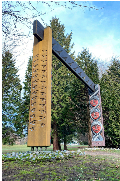
Figure 10. Susan Point (Musqueam), People Amongst the People: Grandparents and Grandchildren , 2008. The three grandmothers pictured here illustrate the matrilineal knowledge that passes from generation to generation.

but it is distinctly political” (Ariss 2019, p. 62). In other words, for the artists and their communities, these works are a powerful statement of ongoing presence and sovereignty in unceded territory, even if this intent is not fully recognized by those passing through YVR.