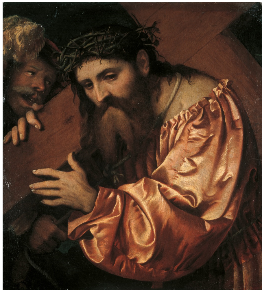
Figure 3. Girolamo Romanino, c. 1542. Oil on canvas, 81 × 72 cm. Pinacoteca di Brera, Milan.