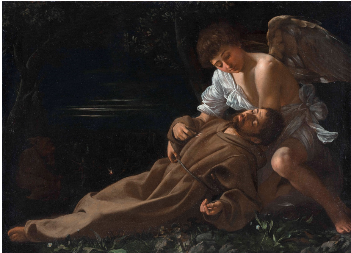
Figure 5. Michelangelo Merisi (Caravaggio), Saint Francis of Assisi in Ecstasy , c. 1594. Oil on canvas, 92.5 × 127.8 cm. Wadsworth Atheneum Museum, Hartford.

absent, and (3) the wounds in Saint Francis's hands and feet are also noticeably missing; only the wound in his side is visible. Pamela Askew suggests that it was only when the seraph disappeared that the wounds began to appear. 16 Bert Treffers, on the other hand, proposed that Caravaggio depicts the spiritual ecstasy after the stigmatization. 17 Stuart Lingo makes a compelling case supporting the subject of the painting as a stigmatization through the examination of Franciscan and Capuchin texts (Lingo 1998, pp. 186–222). He provides extensive textual evidence that explains the anomalies in Caravaggio's rendition of the stigmatization. Although I agree with Lingo's compelling reading, looking at the iconography through Franciscan devotion and affective chiaroscuro may reveal a more cohesive reading of Caravaggio's first sacred image.