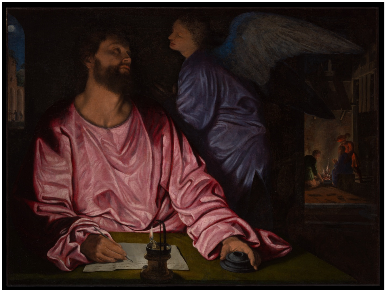
Figure 4. Giovanni Girolamo Savoldo, Saint Matthew and the Angel , 1534. Oil on canvas, 93.4 × 124.5 cm. The Metropolitan Museum of Art, New York.

The influence of Leonardo-Franciscan chiaroscuro can also be found in subjects beyond Christ's Passion. Brescian painter Giovanni Girolamo Savoldo's 1534 Saint Matthew and the Angel (Figure 4) depicts the Evangelist at his desk penning his gospel, lit only by the candle that flickers at its edge. Surrounded by darkness, the viewers' eyes focus on the play of flickering candlelight on his red and pink garment. Matthew turns his head upward, casting most of his face in shadow, as he looks toward the angel that hovers slightly above him for divine inspiration. Here, Pseudo-Dionysius's angelology and mystical guide, both of which influenced Franciscan writers, can facilitate our understanding of what Savoldo presents to the viewer. The angel, Pseudo-Dionysius's third rank of angels, those that preside among and as guides for humans, guides ("inspires") Matthew to write the words of his Gospel. Although Matthew appears to look up toward the angel, his gaze looks beyond the angel to the black recesses of the room above him. Chiaroscuro once again functions on a practical level to form the figure of Saint Matthew and to focus our attention, but the Evangelist then directs our eyes to divine darkness. 14