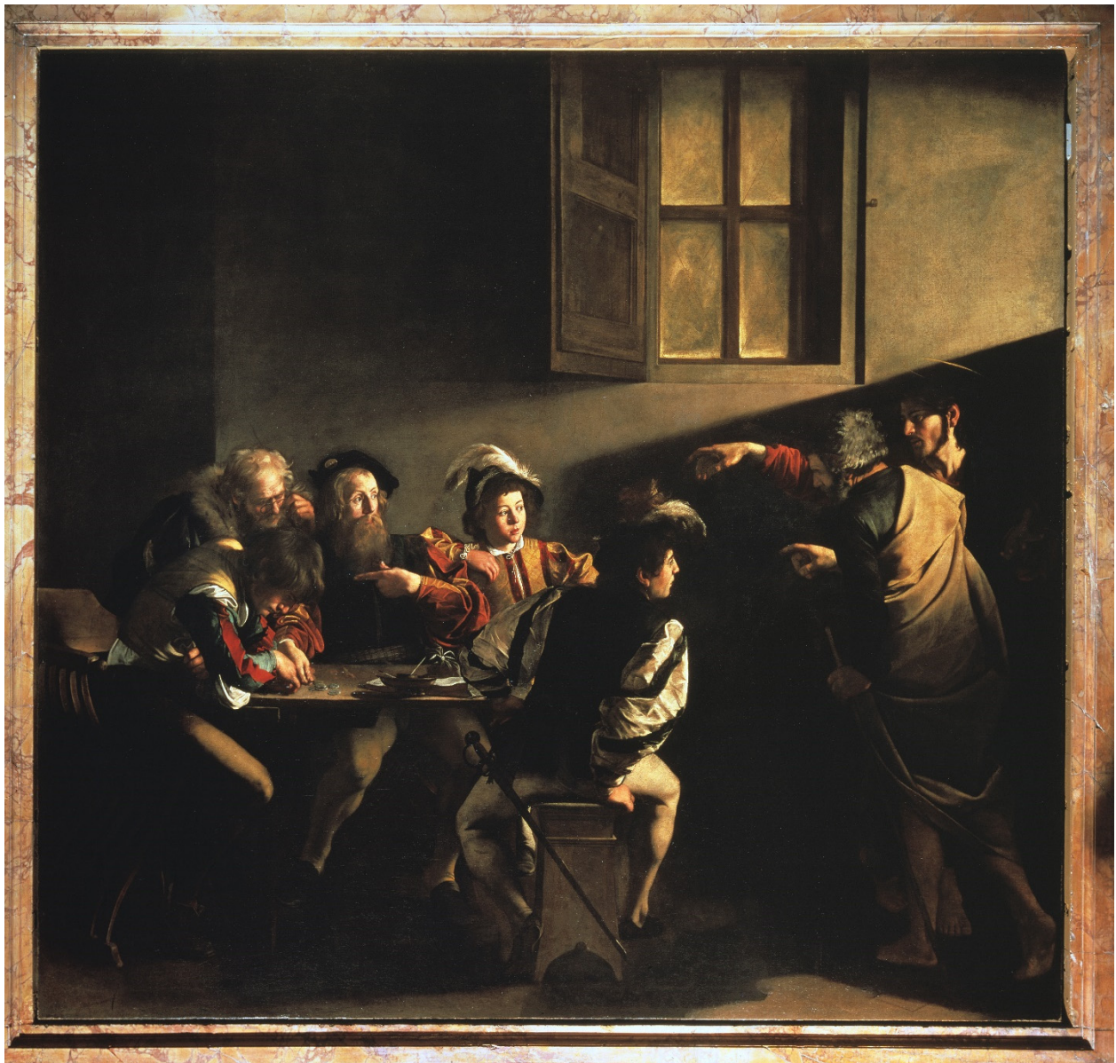
Figure 7. Michelangelo Merisi (Caravaggio), Calling of Saint Matthew , 1599–1600. Oil on canvas, 322 × 340 cm. Contarelli Chapel, San Luigi dei Francesi, Rome.

Funding: This research received no external funding.