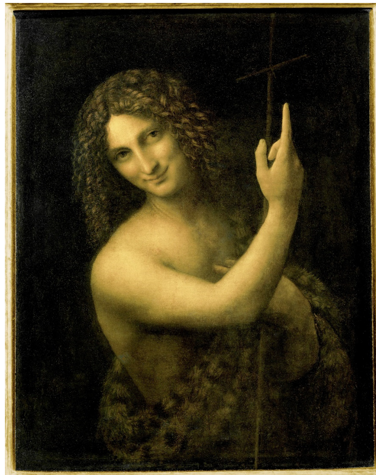
Figure 2. Leonardo da Vinci, Saint John the Baptist , c. 1513. Oil on panel, 69 × 57 cm. Musée du Louvre, Paris.

lie simple, absolute and unchangeable in the brilliant darkness of a hidden silence. Amid the deepest shadow they pour overwhelming light on what is most manifest. Amid the wholly unsensed and unseen they completely fill our sightless minds with treasures beyond all beauty. (Luibheid 1987, p. 135)