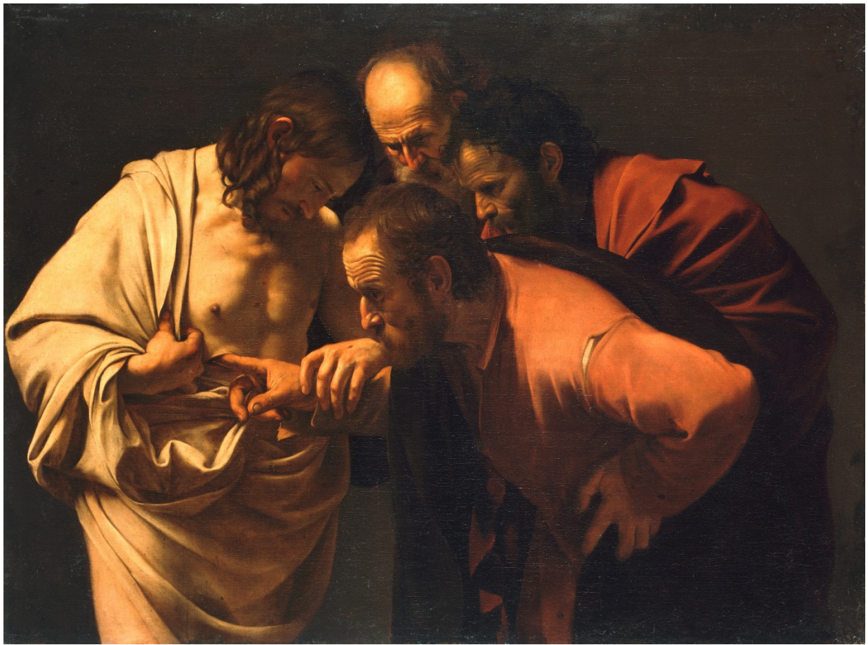
Figure 6. Michelangelo Merisi (Caravaggio), Incredulity of Saint Thomas, c. 1604. Oil on canvas, 107 × 146 cm. Sanssouci, Potsdam.