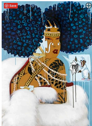
Figure 2. Rozeal. Untitled. 2016.

identities (Abiko 2003; Anderson 2007). Utamaro's work differed from others of that time, featuring women in active roles and having a level of agency (Anderson 2007). Some of Rozeal's paintings mirror specific paintings by Utamaro, and like Utamaro, depict women as determiners of fashion, engaged in personal activities (Anderson 2007). Rozeal expands on the theme of women as independent subjects of the art, rather than depicting women in service to men, showing female subjects, often in quiet moments with other women (Figure 2).