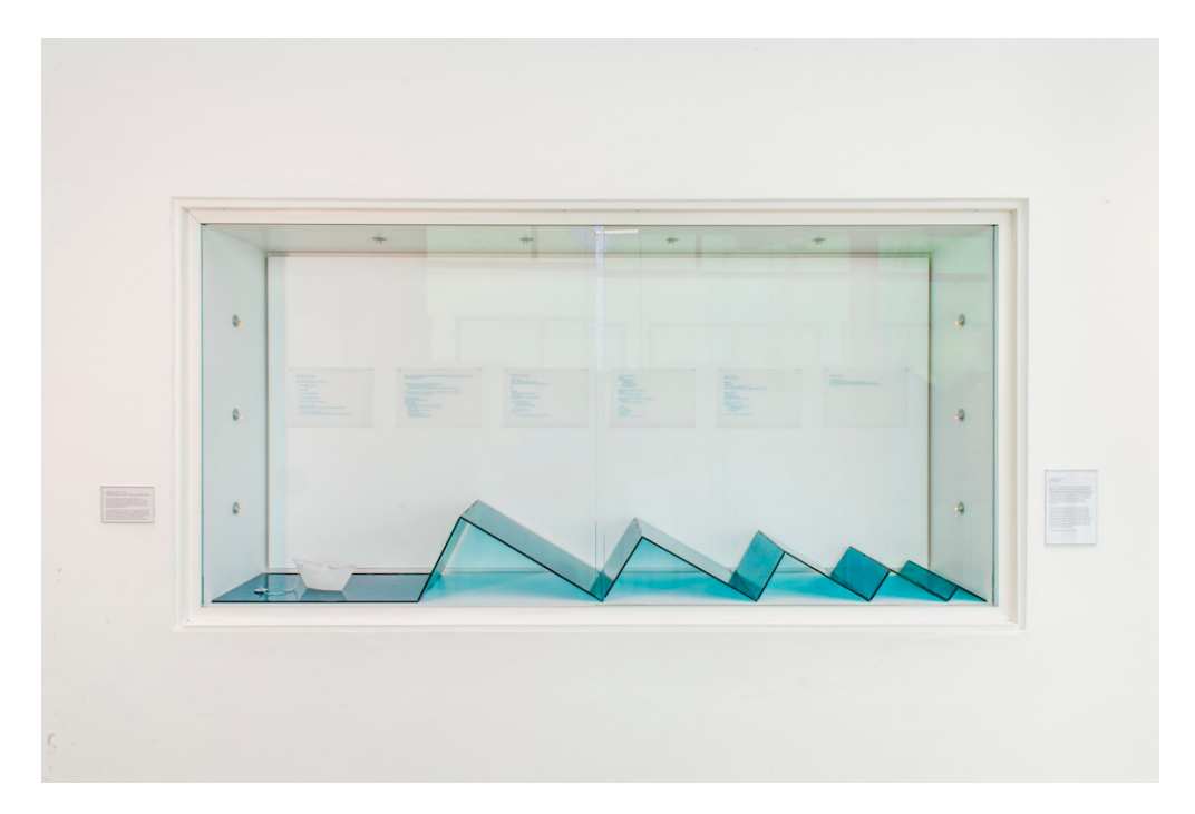
Figure 3. Material Journey , 2018—final work with a cast glass boat with a rubber plug hole atop a fused glass wave, with poem text in the background.