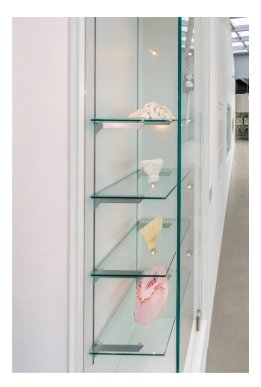
Figure 2. Material Journey (stages), 2018: processes displayed.