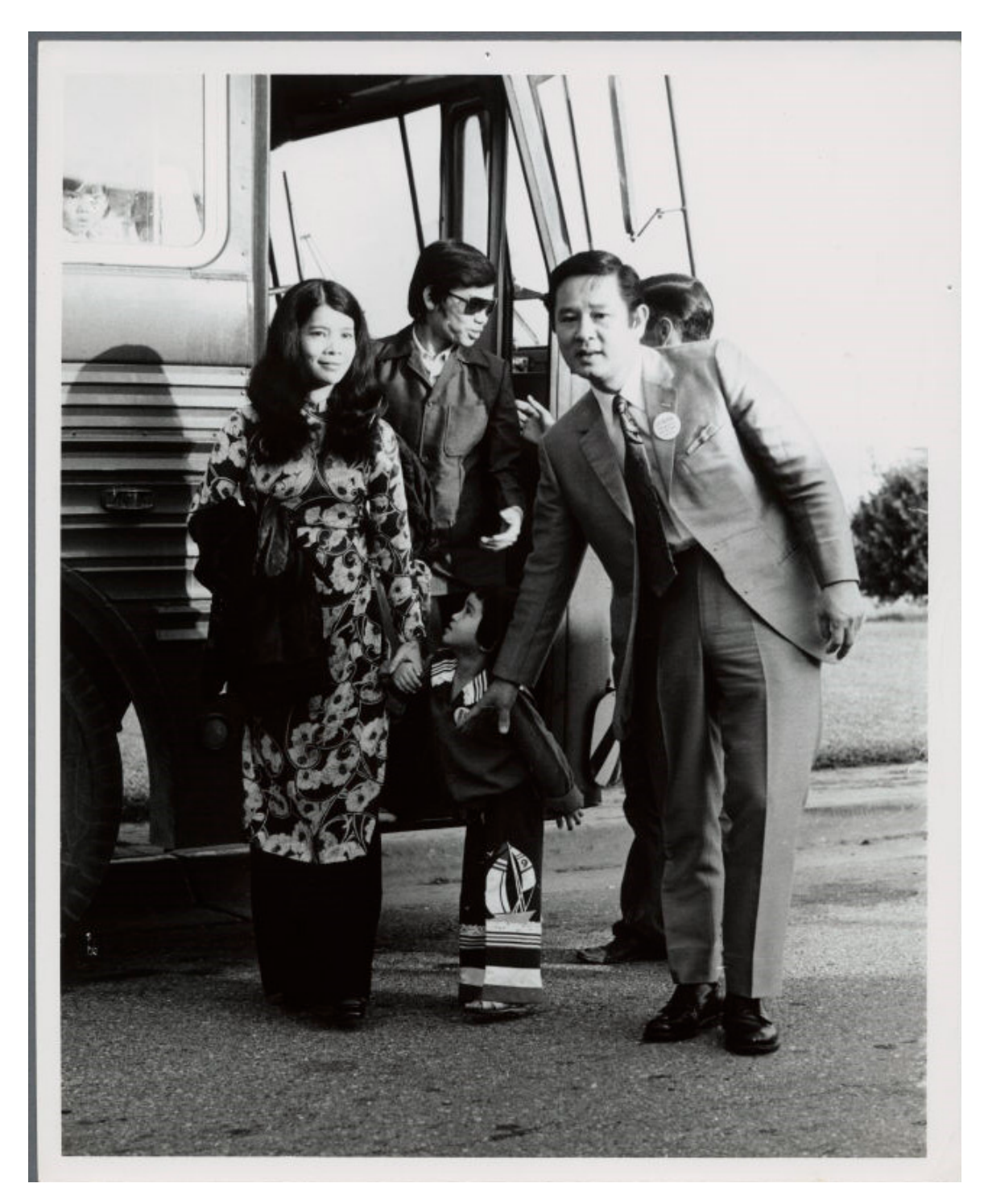
Figure 1. "Couple with child coming off a bus. Fort Chaffee (Ark.)".

Scholars of race and migration have demonstrated that immigration control practices at the border and through the law have produced sexuality, gender and race, and class identities through various procedures and classificatory schemes (Luibhéid 2002, p. xxii; Ngai 2004). While these concerns would appear to be related to the sociology of immigration, its sub-field of assimilation studies on the other hand has tended to focus on the ways that migrants who have successfully crossed the border have integrated economically (Coutin 2015). The practices of refugee management and the knowledge regimes that are simultaneously produced are not neutral, but intimately tied to the United States as an imperial white-supremacist settler-nation. Rather than pre-existing categories, refugee,