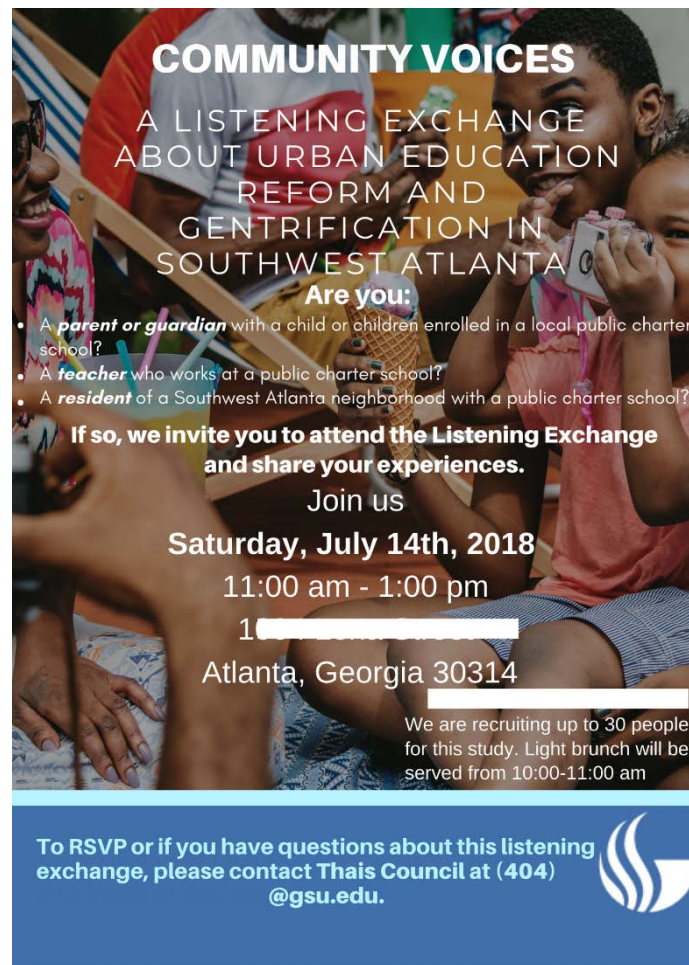
Figure 2. CLE recruitment flyer.