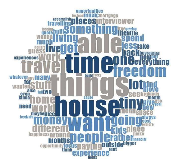
Figure 6. Word cloud for Motivator 5.

I'm an experience person. I have nice things, but I don't love my things ... I'd rather spend $2000 on a trip to South America than on a TV ... I have a $300 TV ... I'd rather take that other $1500 and spend it on an experience. –Bernie (18–34)