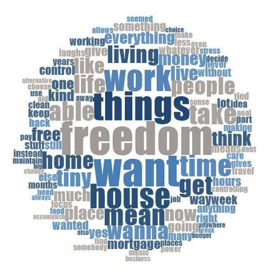
Figure 3. Word cloud for Motivator 2.

Eighty three percent of participants expressed a deep desire to take back their lives. Many TH enthusiasts saw living tiny as a gateway to "being in control of ... life" or at least help to "redefine where the quality of ... life [should be]." While often couching it in the language of wanting "more time and money", many interviewees expressed "want[ing] out of it". Seeing their mortgage, debt, long work schedules, and the consumerist lifestyle as contemporary forms of "slavery", they longed to break free from oppressive structural forces that they felt held them back from the rich and fulfilling lives they longed to have (also see Figure 3). To attain this true sense of autonomy and overcome the grips of what Brittany called the "American lie", many TH enthusiasts stressed that one needed to go beyond the simple idea of freedom from and embrace the much richer and much more genuine freedom to orientation to life (Fromm 1941).