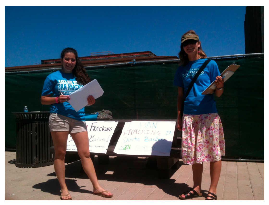
Figure 1. Youth activist (left) and author collect signatures for Measure P at University of California Santa Barbara (UCSB), April 2014.<sup>6</sup>.

and shared with other organizations. I employed snowball sampling in a couple of cases and in all, pursued maximum variation sampling (Lofland et al. 2006) to interview youth at all levels of activist involvement (from leaders and trained organizers, to people who had been members of a group for only a short time) and of varied racial and gender identities. To gain diverse insights on how to create a more inclusive climate justice movement, I oversampled activists of color, who are underrepresented in local and national movements for climate justice, and especially in adult organizations (Taylor 2014). Fifty-two percent of interviewees identified as women or female, 41% identified with multiple racial and ethnic identities, and 31% identified as persons of color.