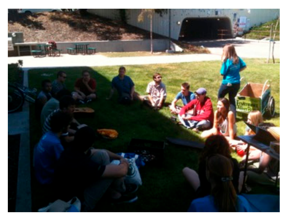
Figure 5. Student coalition meets to organize signature gathering for the ballot measure against extreme oil extraction, later named Measure P, in April 2014.

center relationships, accessibility, intersectionality, and community. They occur in the context of other practices and participatory democratic forms of organizational structure that are horizontal (see Figure 5). The majority of groups interviewees organized with have broad leadership structures. Environmental Affairs Board (EAB), for example, has twenty-one officers with two co-chairs. Students Against Fracking began with three co-chairs, but rotated facilitators during meetings, using consensus decision-making to organize campaigns. During this research, 350 Santa Barbara had no leadership structure or positions. These horizontal leadership forms are one-way groups tried to empower leadership from diverse members.