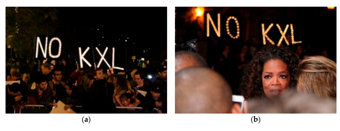
Figure 3. (a) No Keystone XL Pipeline Protests in Santa Barbara, 2014; (b) Oprah at the Santa Barbara Film Festival.