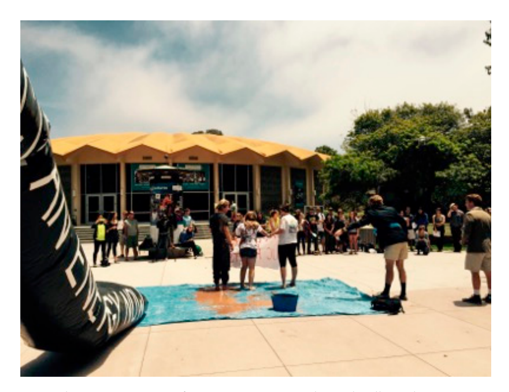
Figure 2. Fossil Free UCSB protest of May 19, 2015 Santa Barbara oil spill. Mock UC representatives shake hands with oil companies as a pipeline spills fake oil on students. This protest was Fossil Free UCSB's biggest of the year, made more successful by the group's efforts to strengthen relationships among members.

in having these really intentional one-on-one conversations that are not about campaign strategies, it's not talking about the campaign at all...it's focusing on getting to know someone, what's driving them, where they are coming from, and using a whole series of them [conversations] to build up this trust between two people. And so, when they organize together, there's that relationship built.