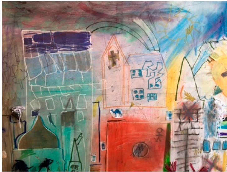
Figure 2. Future city, example one from a northern English Primary School, 2018. This image features a mosque, a church and two high-density housing estates. RMIT University Human Ethics Clearance Number 21071.