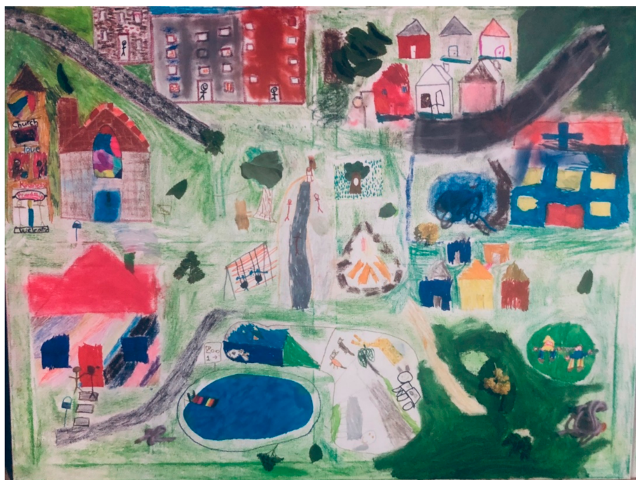
Figure 4. Future city, example from an Australian church youth group, 2018. This image features a community pool, a zoo, a campfire, a large playground, a church with stained glass windows, a hospital and a number of houses. RMIT University Human Ethics Clearance Number 21071.

These three collectively devised images (Figures 2–4) are all large canvasses that have been collaboratively drawn and decorated by groups of 4–6 children aged between 4 and 9 using pastels, felt tip pens, paint pens, and collage materials (including wool, felt, cotton printed fabric). These canvasses depict imagined future cities comprised of “what really matters”. Figure 2 features a mosque in the lower left-hand corner of the picture, positioned in front of a large high-rise block of flats. There is a church in the middle of the painting and further housing to the right of the canvas. At first glance, this city is clearly designed for high density living. Trees and a sun decorate the backdrop of the painting. Figure 3 features a large hospital, a mosque, a church, busy roads, houses, and a school. Strikingly, there are not a lot of people in these images, even though there are lots of places designed to be inhabited by people. Figure 4, created in Australia as opposed to the UK, bears some similarities to the UK images, although 11 people and 6 animals feature in this city, which marks a stark contrast to images from the UK, that only gesture towards people through drawings of cars.