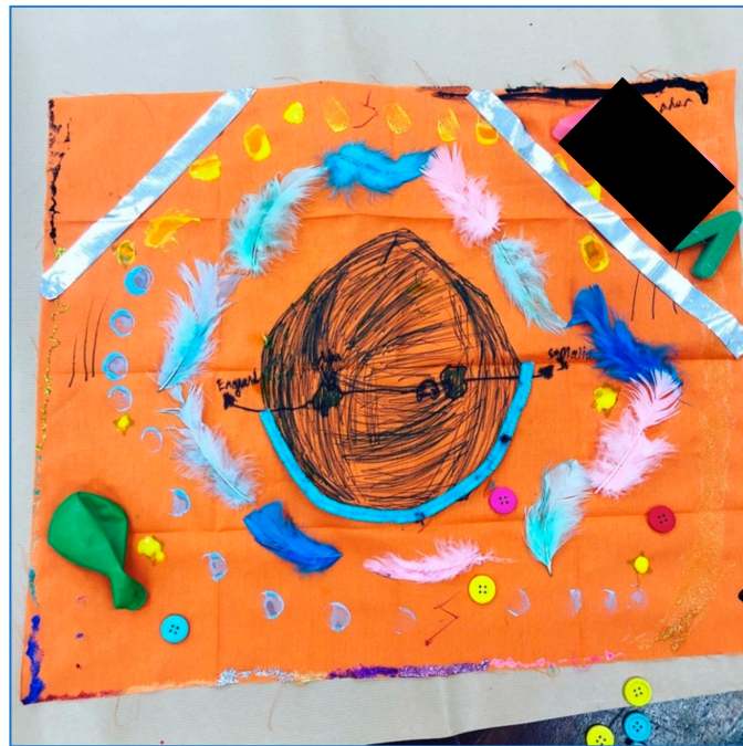
Figure 5. Expressive representation of migration from Somalia to the UK drawn by a South East London boy. RMIT University Human Ethics Clearance Number 21071.

The second picture about migration, religion and identity, which is featured below, is more symbolic and less of a literal depiction of a migration story. In addition to implied geographical movements, the image addresses themes of religion and culture, family and ritual. All these themes are very important to the artist who painted the textile work.