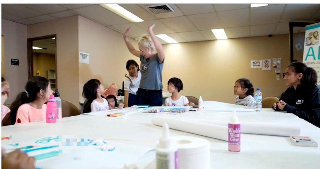
Figure 1. Making and belonging: children and researcher share stories of home. RMIT University Human Ethics Clearance Number 21071.