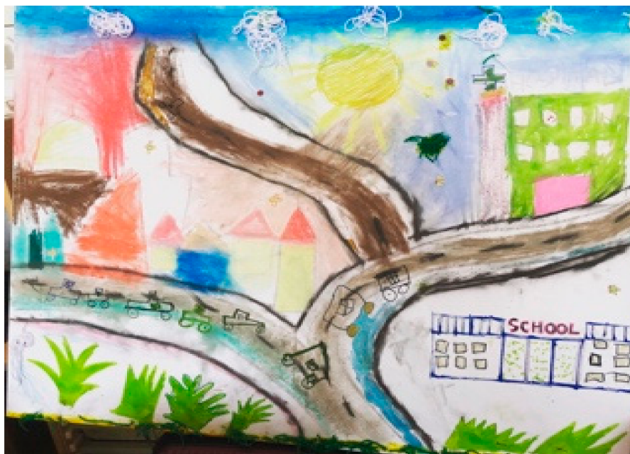
Figure 3. Future city, example two from a northern English Primary School 2018. This image features a school and a hospital (the green building) a mosque, a church and a number of houses. RMIT University Human Ethics Clearance Number 21071.