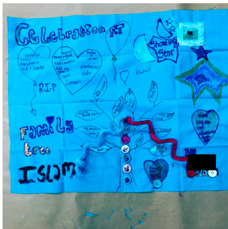
Figure 6. Expressive representation of religion, culture and belonging. Created by a South East London girl. RMIT University Human Ethics Clearance Number 21071.

These materials (Figures 5 and 6) re-present family stories, life experiences and cultural worlds. They also offer us a different comment on the material organization of culture to the existing work of scholars who consider visual and material cultures of religion. Children position belonging in relation to both Muslim and Christian/Anglo festivals and position family clearly at the center of belonging. This perspective takes seriously the pedagogical nature of materiality, building upon Karen Barad's argument that