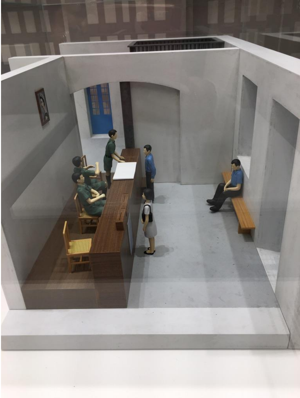
Figure 5. Miniature diorama of the Report Room. Image author's own.

ability to reveal. By removing food from one system of classification (the carceral) and placing it into another (aesthetics), heterotopic dissonance is created which blurs, rather than makes clear, the boundaries between suffering and succor. 4