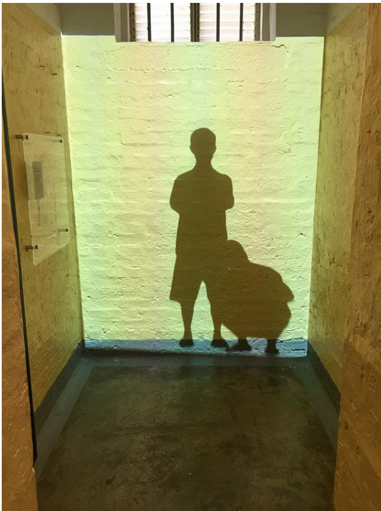
Figure 2. Silhouettes of prisoners projected onto walls of prison cells.