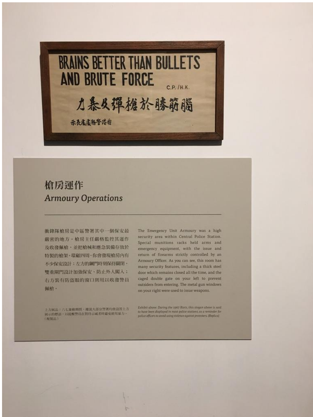
Figure 8. Problematizing force: a plaque from the 1967 riots.

innovation and creative freedom in the city, with the cultural agenda of CPS dominating visitors' ways of seeing.