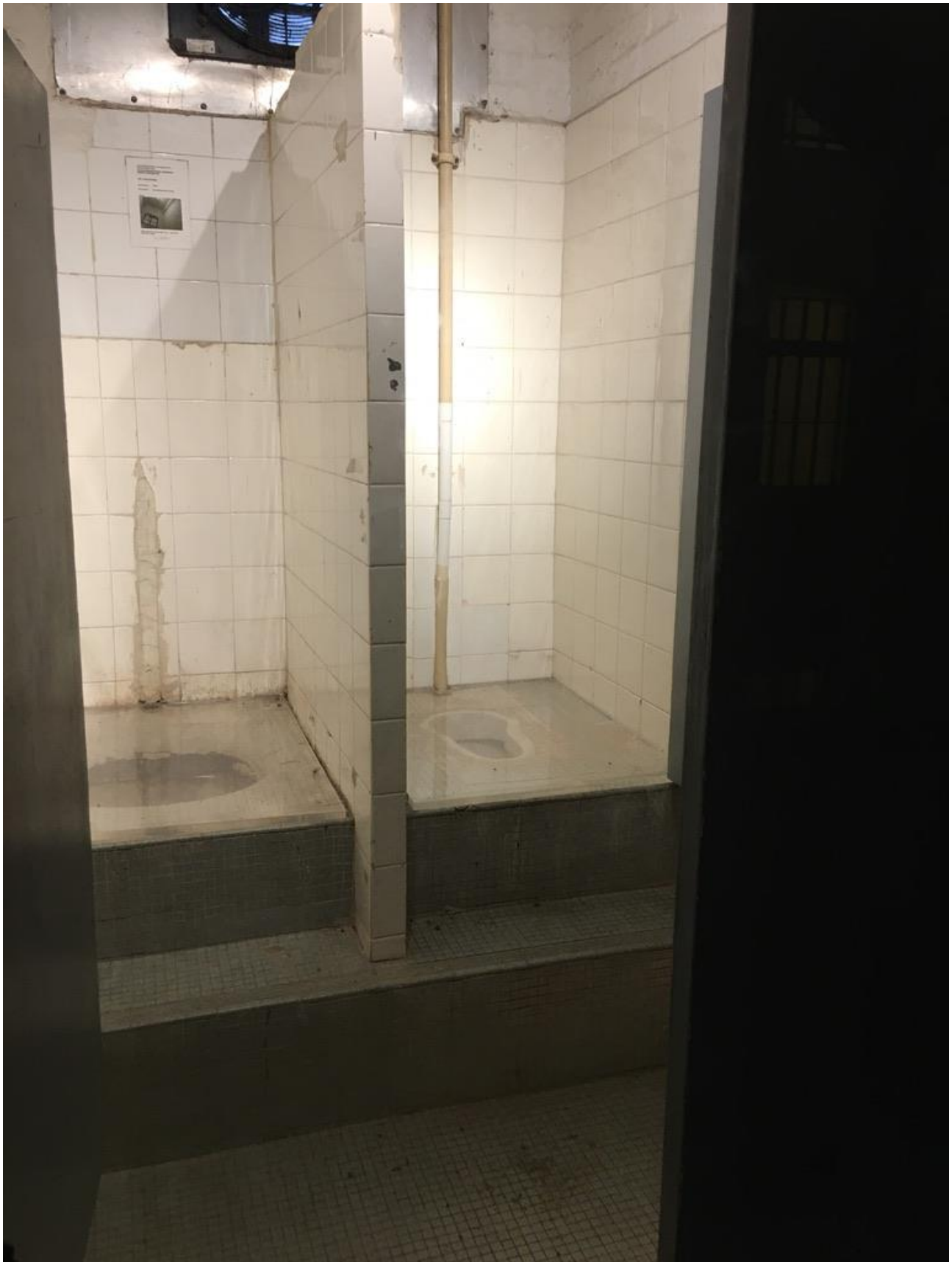
Figure 6. Prison hygiene and the lack of privacy on display.