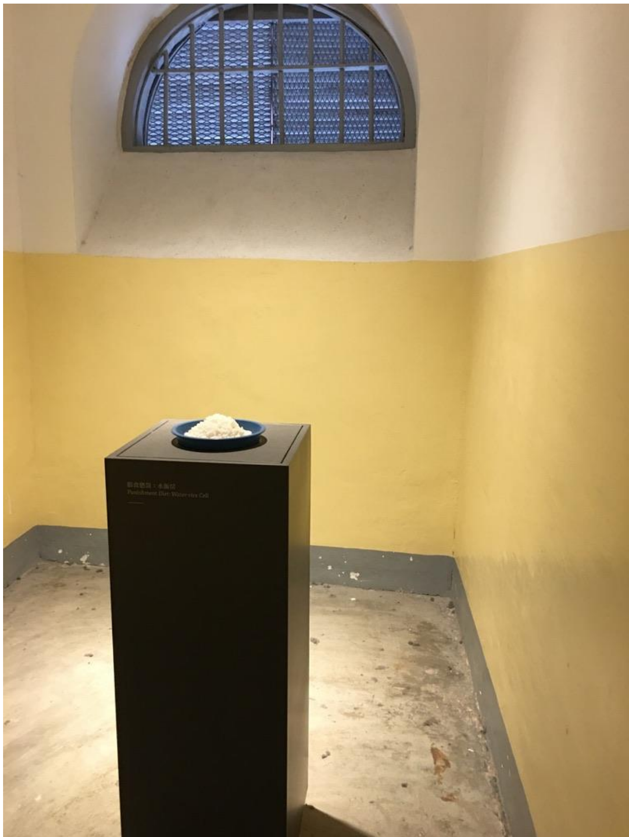
Figure 7. A bowl of rice on display to illustrate “water rice” diet as punishment.

Like prisoners, visitors’ bodies are also cultivated or “fashioned” to enhance an aesthetic experience through engagement with spaces of incarceration and violence aestheticized by the estrangement of objects into art or decoration. Such objects as the bowl of rice