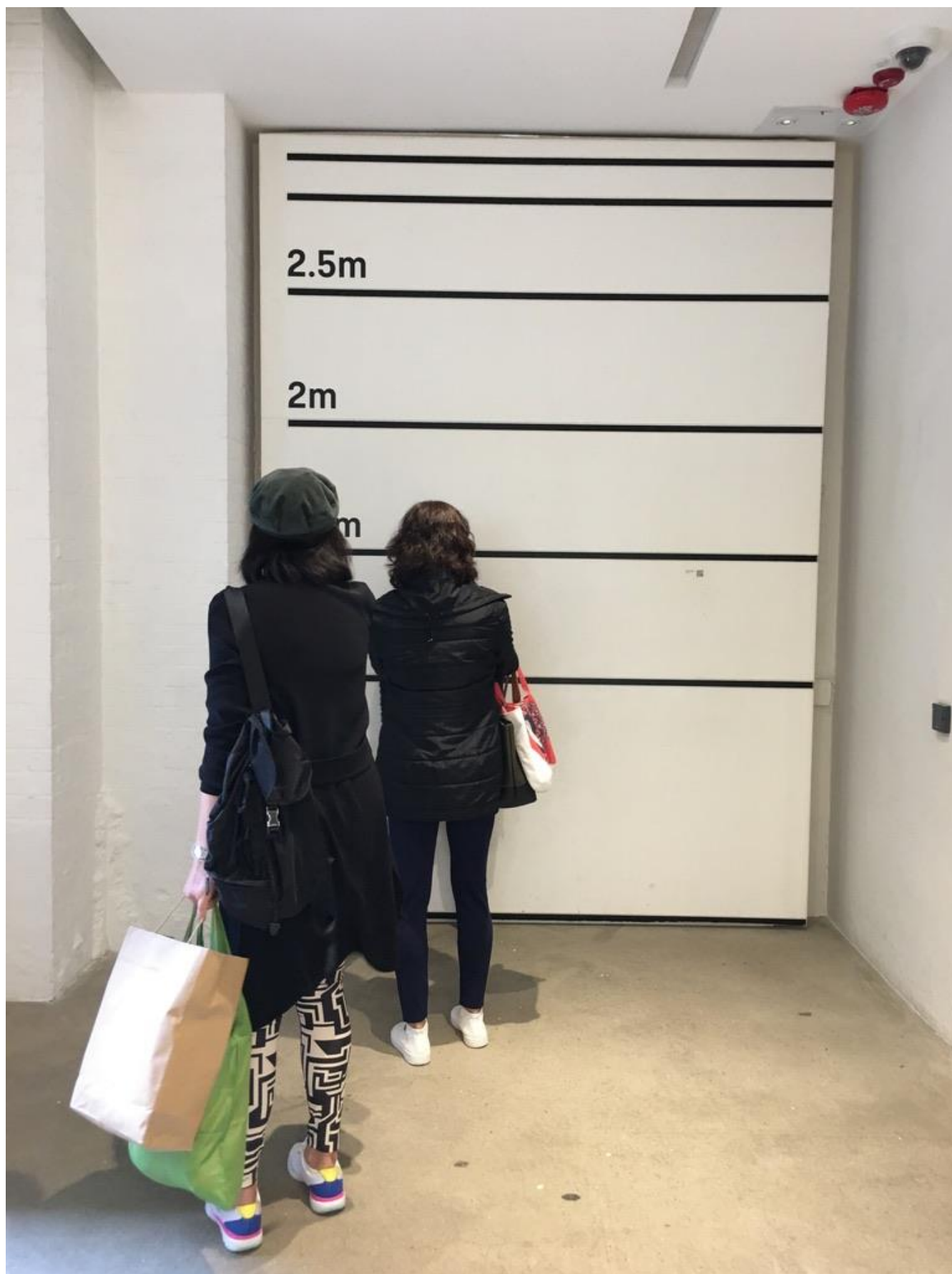
Figure 4. Visitors becoming prisoners in the former Prisoners Admission Building.