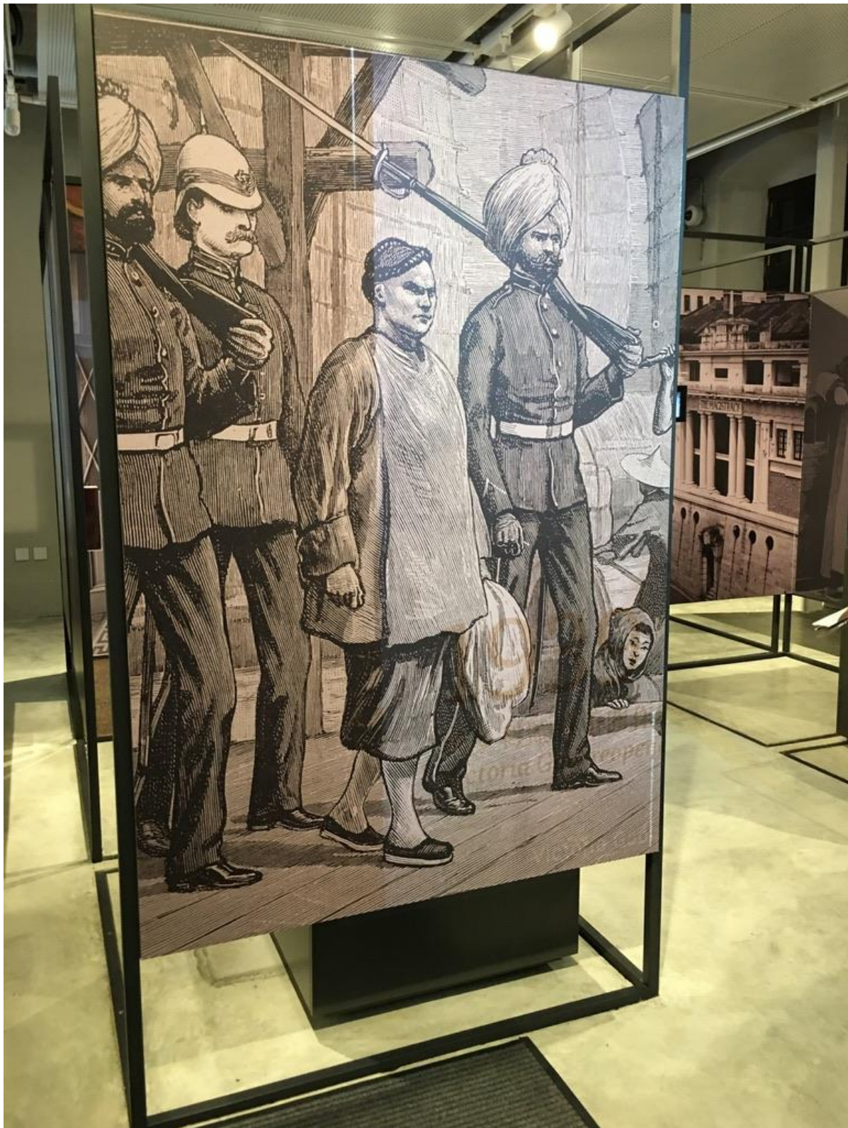
Figure 1. Chinese criminals under British “law and order” on display at Tai Kwun.

general public was finally allowed behind its doors into an area of Hong Kong that was simultaneously symbolic to and estranged from daily life.