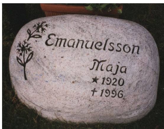
Figure 2. A woman's name inscribed to the right in 1996, with the space on the left preserved for her surviving husband's name. This crematory urn gravestone, decorated with a woodbine, a flower of the Bohuslän province in Sweden, is located in the cemetery in the coastal village of Hunnebostrand.

In Norway the reuse of old gravestones is quite common, but it has been unusual in Sweden until the present time. Before being reused, the stone surface is ground smooth, and new inscriptions and