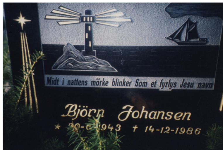
Figure 3. A maritime design showing a ship at sea together with a lighthouse and the Christian inscription, “In the gloom of night Jesus’ name shines out like a lighthouse”. There is also a shining star to the left. Gravestone for a forty-three-year-old man at Vestre Gravlund cemetery, Oslo, 1986.

In Norway, worldly pictorial symbols on gravestones are fairly often combined with Christian symbols or epitaphs, which seems to reflect a greater degree of religious consciousness. The symbol of a boat or ship, which in Sweden stands for occupational or leisure time interests, in Norway may be combined with a religious inscription in which life is presented as a voyage. Eternity is then a shore on the far side of the sea. The darkness of death is illuminated by Jesus' name (Figure 3). An anchor or flowers entwined with a cross can also show the merging of the sacred and the worldly.