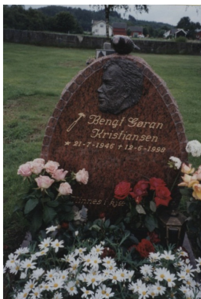
Figure 1. A bronze portrait fastened to the front of a gravestone erected in memory of a fifty-two-year-old carpenter in 1998 in Idd cemetery, Norway. A bronze bird has been set on the top of the stone. The hammer symbolizing a craft is very rare in Norway. Text: “Remembered with love”.

under that of the first deceased, in other words, in the secondary position. Sweden appears to have been more tradition-bound in this respect during the latter part of the 1900s. Previously, however, the man's name was placed uppermost even in Norway. One may presume that the equality debate, which has long dominated the public sphere in Norway, could have contributed to the fact that social customs were discontinued in this country much earlier than in Sweden.