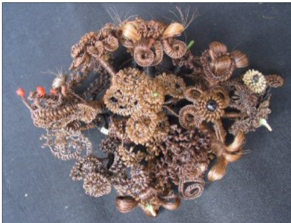
Figure 1. Hair Bouquet, Late-Nineteenth-Century, Omaha, Nebraska.