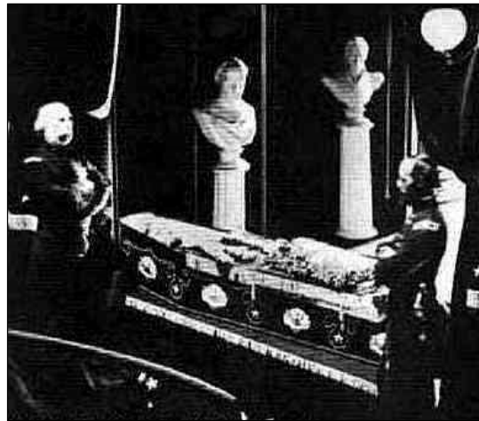
Figure 3. Photograph of Abraham Lincoln's open casket lying in state, April 1865.