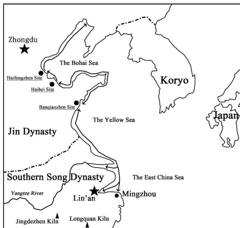
Figure 8. The sketch map of the route for transshipment.

On the other hand, the Haifengzhen and Haibei sites may also have been connected to the southern area via the Banqiaozen site, for the trade of products including porcelain and other southern goods. A large part of the southern cargo arriving at Banqiaozen needed to be transported to the inland or northward areas, however the traffic from here to the Central Plains would have been dominated by land routes. The porcelain, as a fragile product, may have continued to sail northeast around the Shandong Peninsula, with goods being unloaded at the Haibei or Haifengzhen sites, and then eventually, via the salt transportation routes, reaching the hinterland of Northern China. The Haibei and Haifengzhen sites are adjacent, meaning they could also have played the role of complementary suppliers, successively loading and unloading on the west coast of Bohai Bay. Moreover, as the southern porcelain sailed along the Yangtze River, and the east coast had already been established during the Northern Song Dynasty and the Liao Dynasty (Huang 2011), this route would likely still have played an important role during the Jin Dynasty and the Southern Song Dynasty (Figure 8).