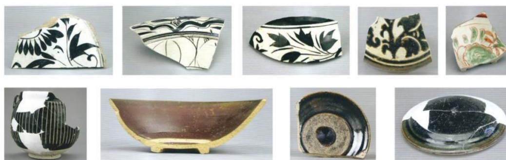
Figure 5. Products of the Cicun kiln, Jin Dynasty, unearthed at the Banqiaozhen site, 2009.

In 2009, a large courtyard from the Northern Song dynasty (960–1127 CE) was excavated within the ruins of Banqiaozhen. Additionally unearthed were more than ten tons of iron coins from the Song Dynasty, and tens of thousands of pieces of porcelain. The excavators speculate that this construction may be tied to the Northern Song Dynasty's Bureau for Foreign Shipping. In addition, there are still some residents who have undertaken activities after the abandonment of the Bureau building site, unearthing a large number of porcelain pieces from the Cicun kiln ( Qingdao Institute of Cultural Relics Protection and Archaeological Research 2014 ) (Figure 5). Therefore, we have inferred that the Banqiaozhen site also played an important role in porcelain shipping during the Jin Dynasty, especially with regard to the Cicun Kiln.