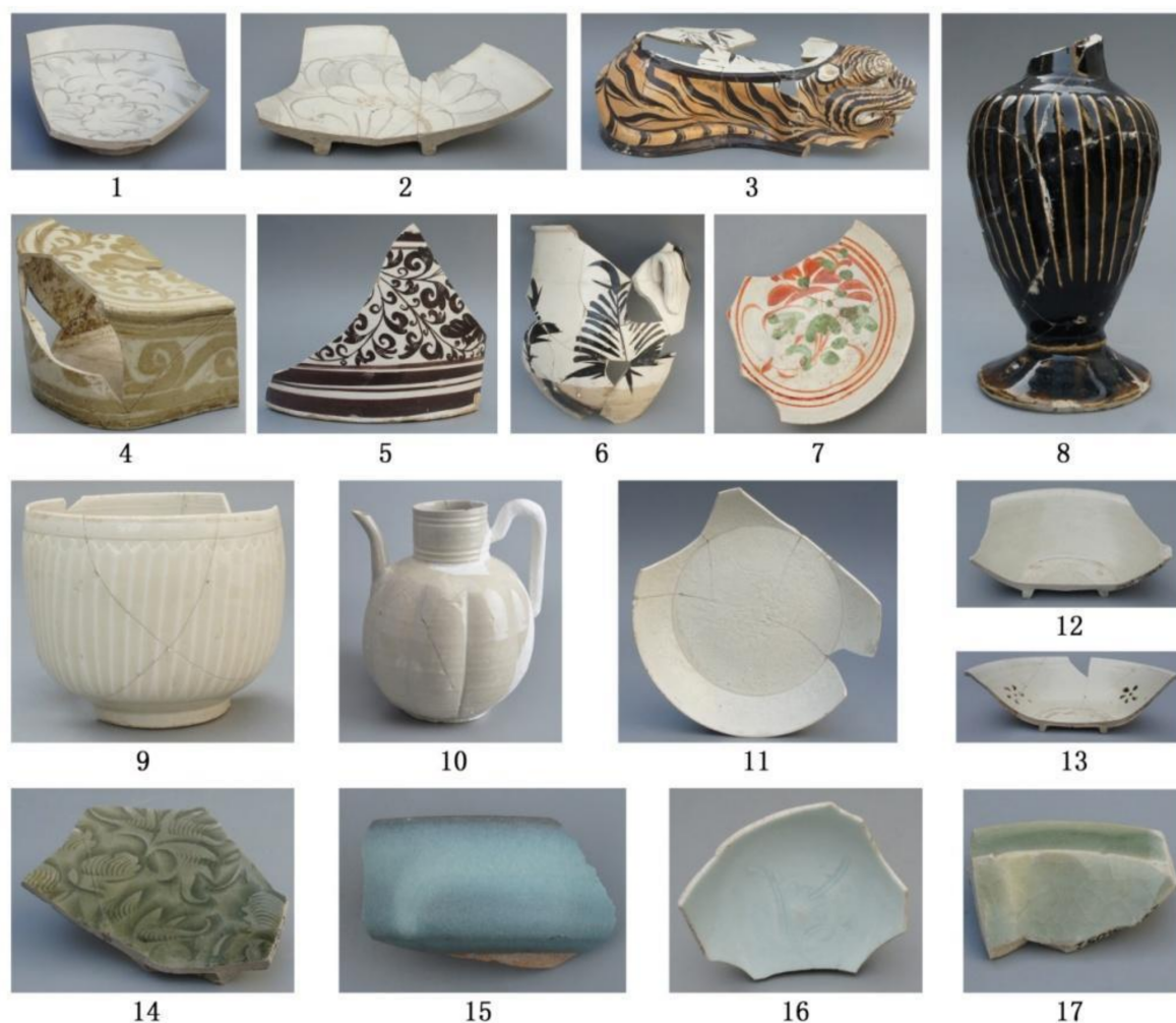
Figure 2. Porcelain unearthed at the Haifengzhen site, 2000. 1–8. Cizhou kiln; 9–12. Ding kiln; 13. Jingxing kiln; 14. Yaozhou kiln; 15. Jun kiln; 16. Jingdezhen kiln; 17. Longquan kiln.

The Haifengzhen site is located at Haifengzhen Village, Yangerzhuang Town, Huanghua City, on the west shore of Bohai Bay in the eastern area of Hebei Province. It was excavated for the first time in 2000, and a large number of porcelains were unearthed, most of which are products of the Cizhou and Ding kilns (including the Jingxing kiln). According to our preliminary observation, of the more than 1700 specimens of porcelain, more than 1200 pieces should be from the above kilns, accounting for nearly 70% of the total amount, while the rest are products of the Yaozhou, Jun, Jingdezhen, and Longquan kilns, along with other domestic kilns. The vast majority of the specimens belong to the Jin Dynasty and the Southern Song Dynasty (1127–1279 CE), while a few belong to the Yuan Dynasty (1271–1368 CE) (Huanghua Museum et al. 2015; Research Center for Chinese Frontier Archaeology of Jilin University et al. 2016) (Figure 2).