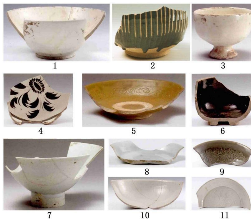
Figure 4. Porcelain specimens collected at the Haibei site, 2006. 1–6. Cicun kiln; 7,8. Jingdezhen kiln; 9. Yaozhou kiln; 10,11. Ding kiln.

The Haibei site is located near the Haifengzhen site, and the features of the two sites are so similar that the Haibei site is very likely to have been another seaport on the western shore of Bohai Bay.