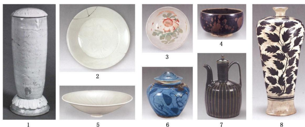
Figure 6. Porcelain of the Jin dynasty unearthed in Japan and the Korean Peninsula. 1,2,5. Ding kiln; 3,4, 6–8. Cizhou kiln or Cicun kiln. (1. Unearthed in Shikoku; 2–8. Collected in the Korean National Museum).

Foreign affairs between Chinese mainland dynasties and the Korean Peninsula or Japan were based on mutual gifts. The journey from the Korean Peninsula to the Jin Dynasty's capital, Zhongdu or Shangjing, could be undertaken via the land road through the Liaodong area (Liu 2007), even with some fine porcelain, without the need of a waterway. However, underwater archaeological discoveries show that Chinese porcelain was very popular in foreign markets. Although the literature is scant in descriptions of overseas trading during the Jin Dynasty, relevant information shows that Chinese porcelains were often discovered 1 in Japanese sites dating from the same time as the Jin Dynasty (Li 2015; Kyoto National Museum 1991), while the ruins of the Goryeo on the Korean Peninsula also reveal many products from the Cizhou and Ding kilns (Figure 6) (Jin 2010). Some bowls also have the similar "X" mark.