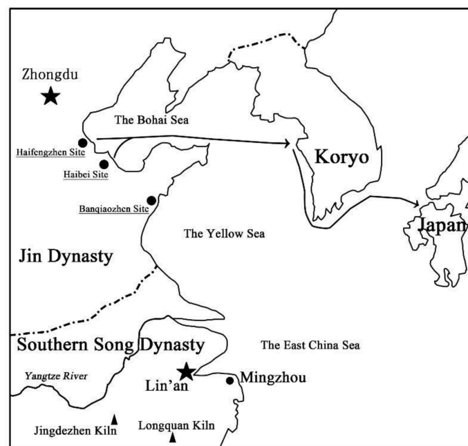
Figure 7. The sketch map of the route for foreign trading.