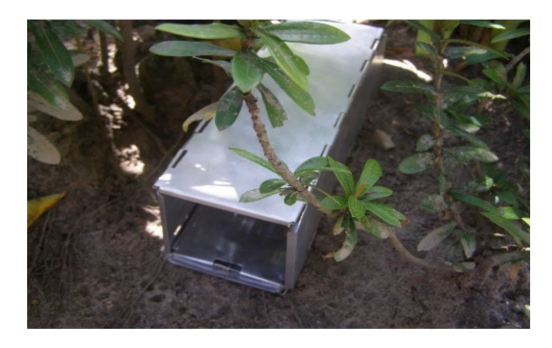
Figure 1. Sherman-type trap.