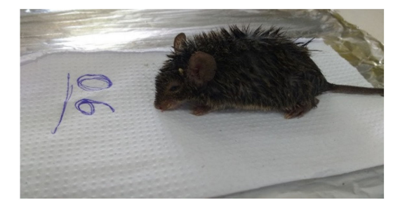
Figure 3. Necromys lasiurus.

ELISA results for the 15 sera tested were negative for the anti-PGL-1 antibody, although some samples showed results close to the 0.2 cutoff . Among the 30 viscera samples, RLEP2 M. leprae region was amplified from samples of three different animals, two being exclusively wild species: (I) liver sample from Necromys lasiurus species, (II) kidney sample Proechimys roberti species, and (III) liver sample from Proechimys roberti species (Figures 3–6).