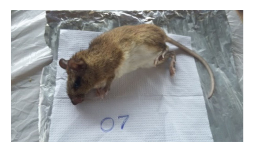
Figure 4. Proechimys roberti.