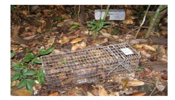
Figure 2. Tomahawk-type trap.