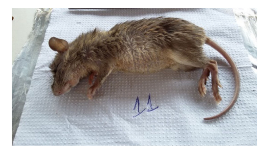
Figure 5. Proechimys roberti.