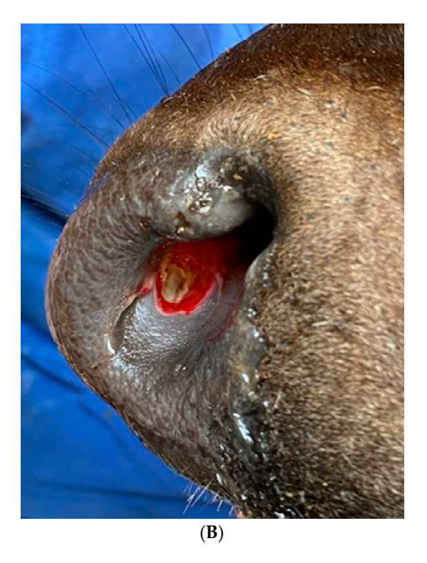
Figure 3. Nasal-septum injuries in a purebred Nellore (( A ), score 5) and an F1 Angus-Nellore (( B ), score 4) calf.

Lambertz et al. [13], who first developed a scoring system to evaluate injuries caused by nose-flap devices, reported that only 3.8% of the calves lacked visible irritations in their nasal septum immediately after device removal. The authors also reported that 30% of the injured calves showed heavy bleeding, and 10% suffered from severe wounds on the day of device removal. In addition, almost 45% of calves were suffering from injuries one week after anti-suckling device removal, showing signs of local inflammation. Taylor et al. [3] reported similar results, indicating the occurrence of hemorrhage, ulcers, and nasal erosions at the time of device removal, classifying them as modest-to-moderate injuries. Despite reporting the occurrence of injuries, which impoverish calf health and welfare, no effort was made by the authors to record the severity and for how long the animals were suffering from nasal injuries. Additionally, these authors [3,13] focused their conclusion on animal performance, indicating the use of nose-flaps negatively impacted calf weight gain, corroborating our results and those from previous studies [4,8,20].