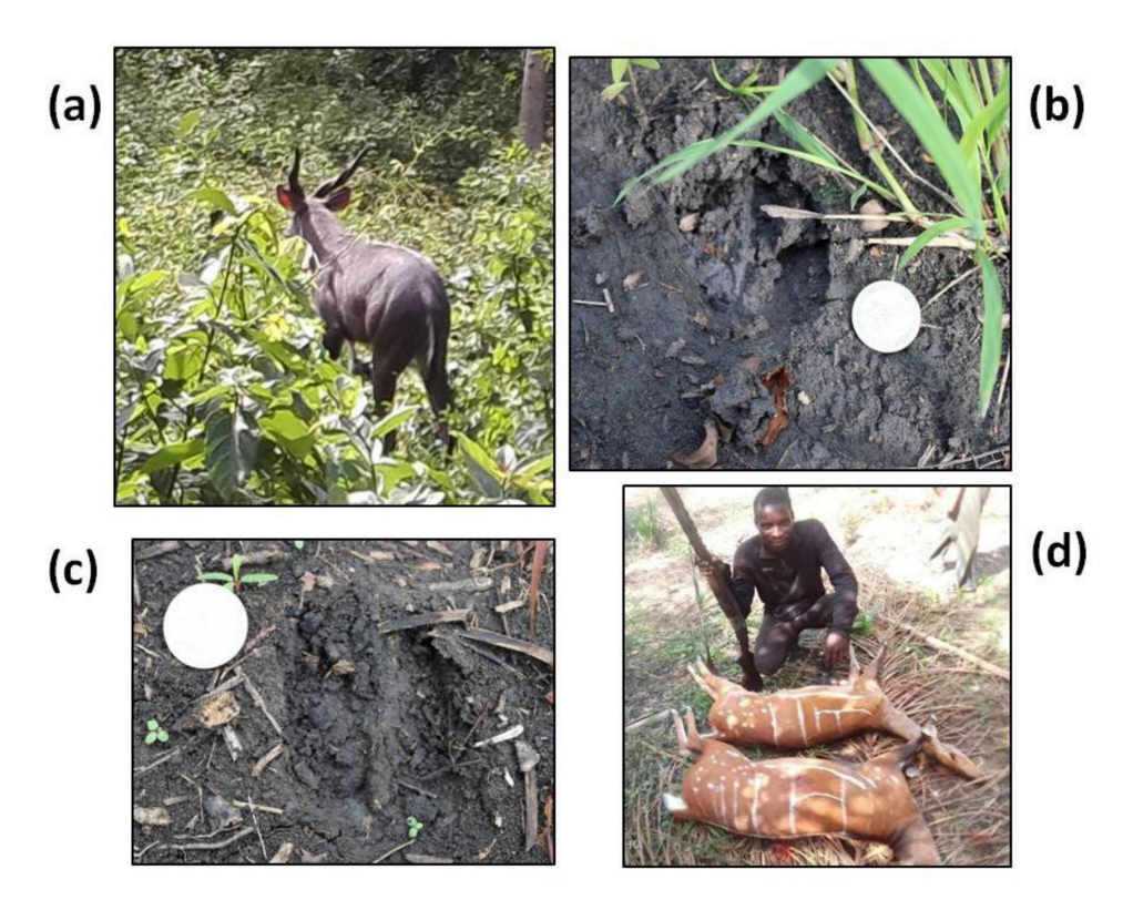
Plate 1. Images of two species of ungulates from the study area: (a) Tragelaphus spekii male; (b) Tragelaphus spekii footprint; (c) Tragelaphus scriptus footprint; (d) a hunter with two Tragelaphus scriptus individuals.