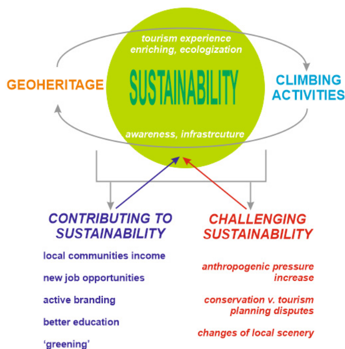
Figure 3. Relationship of geoheritage management (including geotourism) and climbing activities to sustainability.

establishment of geoheritage increases uniqueness of the site, making it more beautiful in the eyes of visitors [144]. On the other hand, too many tourists (climbers coupled with geotourists) or infrastructure over-development (linked to geoheritage management and/or climbers needs) makes sites less natural, which questions scenic beauty [144]. These and the other sustainability-related issues need to be better addressed in the research on geoheritage and climbing activities. As a starting point, this research should become less focused on geoheritage and climbing opportunities and more focused on site visitors, their attitudes, behavior, and perceptions.