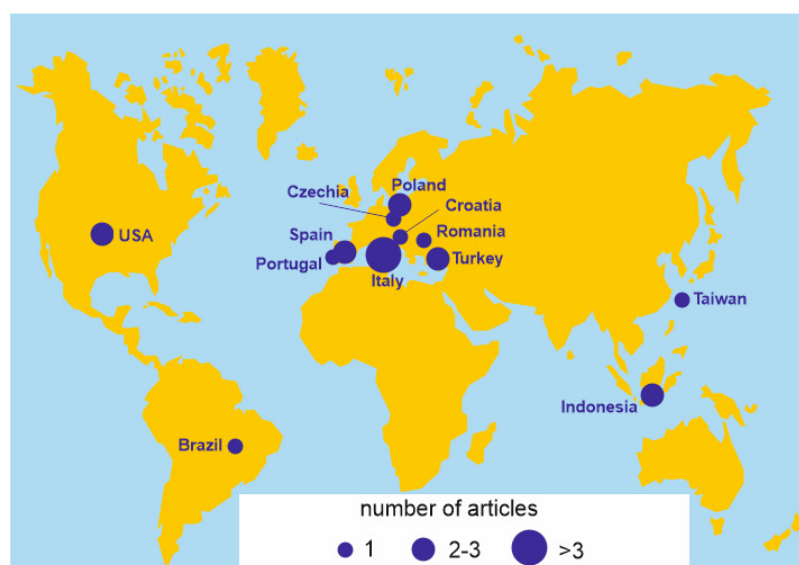
Figure 2. Geographical focus of the research in geoheritage and climbing activities.

Principally, the geographical patterns of the research in geoheritage and climbing activities can be documented with two approaches, i.e., by the author countries (the countries represented by the authors of the considered sources) and by the focus countries (the countries on which the considered sources are focused). Interestingly, the author countries and the focus countries coincide in all cases, with one exception (Table 1). Generally, the research on geoheritage and climbing activities tends to concentrate in Europe (Figure 2). The most studied are the European Mediterranean countries and East European countries, and significant emphasis is placed on the Italian localities (Table 1). The sources considered for the purposes of the present study also represent the Americas and Southeast Asia, but with only very few countries. Although the geological knowledge provided in the reviewed work is heterogeneous and it would be highly challenging to summarize it, the localities considered by previous researchers (Table 1) represent very distinct geological and geomorphological domains. Nonetheless, the number of works is too small to judge this entity of the literature comprehensive or even representative in regard to the geological/geomorphological environments.