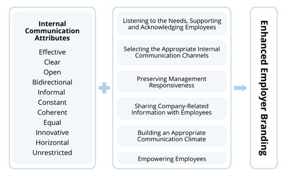
Figure 2. Model for Internal Communication-related Recommendations to Achieve an Enhanced Employer Brand.

Based on the systematic literature review and the results obtained, a new model for Internal Communication-Related Recommendations to Achieve an Enhanced Employer Brand is proposed, as seen in Figure 2. This combines the attributes of internal communication (Table 1) with the recommendations identified (Table 2) to improve employer branding in an organisational context.