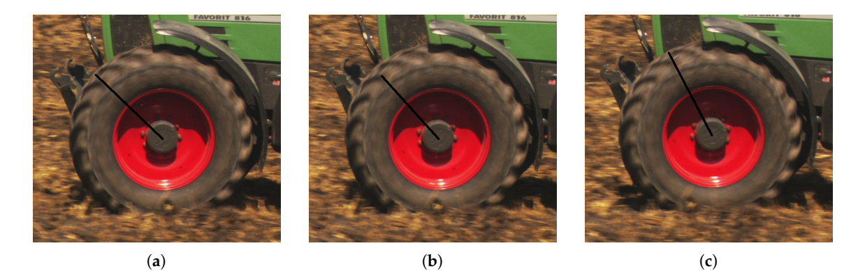
Figure 2. Three frames extracted from the Tractor sequence: ( a ) Current picture (POC N), wheel angle 136; ( b ) reference picture 0 (POC N-1), wheel angle 132; ( c ) reference picture 1 (POC N-4), wheel angle 118. While the wheel is in a more distant position in ( c ) than ( b ), an acceptable prediction can be done with ( c ) using the wheel rotational symmetry

There are two interesting results for the method using variance to skip affine mode, Twilight Scene and Fungus Zoom, where the efficiency increases with checking the affine mode less often. This happens because the Rate Distortion Optimization (RDO) process is not perfect. While we do not