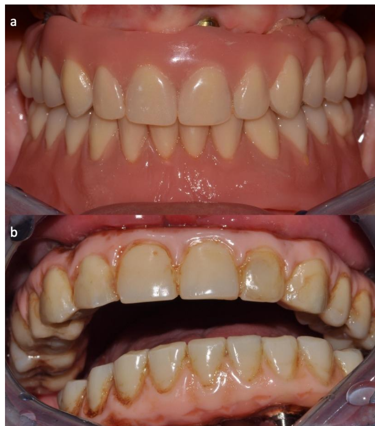
Figure 3. Clinical appearance after 3 months. The onset of chlorhexidine-related stains is evident. (a) Experimental group; (b) control group.

Both groups show an improvement in the two analyzed periodontal indices. Regarding the bleeding index (mBI), in the test group, there was an improvement ranging from a minimum of 42% in a patient to a maximum of 100% in three patients with single crowns. The control group had a minimum percentage of 36% and a maximum of 88%. The plaque index improved in both groups, with a minimum reduction of 0% to a maximum of 100% in a patient for the test group. The control group demonstrated a minimum percentage of 43% and a maximum of 100% in a patient. The average rate of improvement for the values of mBI and PI of the two groups at the end of experimental treatment was also calculated.