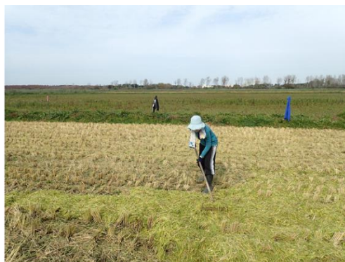
Figure S1. Cutting and spreading rice straw (27 October 2017).