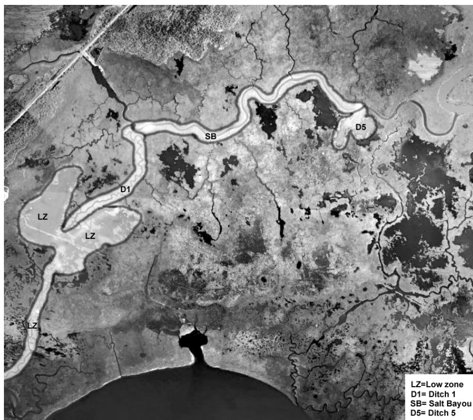
Figure 1. cont.

Las Conchas Marsh is a 16.2 km 2 private intermediate wetland in Southeastern Louisiana and has been used as a study site by the authors for multiple projects, starting in May of 2009 (Figure 1). Baseline H:L ratios were collected from this population in September of 2009 for projects other than this one and used as reference data for this study [9]. This marsh was visually confirmed to be inundated with oil (a perceived stressor) from the Deepwater Horizon Oil Spill on 2 July 2010 [10]. The bordering Rigolets (the waterway between Lake Pontchartrain and the Gulf of Mexico) and eastern Lake Pontchartrain were closed to fishing by state authorities on 5 July 2010 as local clean-up efforts were initiated. Clean-up efforts resulted in increased boat travel, human activity in the main public waterways within the marsh, and the presence of increased noise, equipment, and light in the area. Herein, we consider these necessary clean-up efforts as a component of the overall disturbance event and the effects of each component are not separated or specifically analyzed.