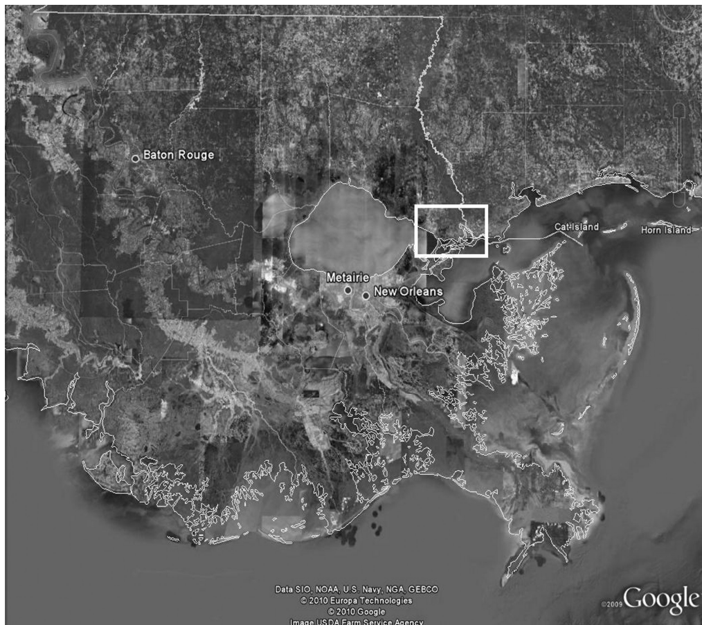
Figure 1. Aerial Image of Las Conchas Marsh with four sampling sectors highlighted; Low Zone, Ditch 1, Salt Bayou, and Ditch 5. This image accompanied by a southeast Louisiana map showing relative area of study site in highlighted box.

Twelve alligators were captured during the post-inundation sampling period (July–October, 2010) in addition to the four alligators captured in 2009. TL, SVL, and BM were recorded for these individuals. BM of one animal (SL16) was not recorded as a result of mechanical failures. Animals were captured by snare pole and lifted onto the boat for morphometric data collection in no more than five minutes to avoid handling stress. Following capture, blood samples were obtained to quantify stress response via heterophil to lymphocyte ratios (H:L) as described previously [6,9,11–13]. Briefly, whole blood aliquots were stained with Giemsa-Wright stain and leukocytes were enumerated under light microscopy (40×) to obtain H:L ratios for each individual. These ratios were examined to determine relative differences in stress between alligators captured during the pre-and post-oil inundation periods.