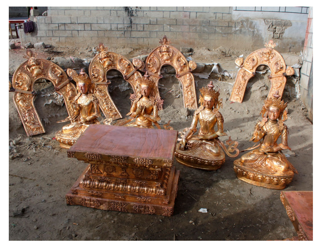
Figure 4. Unfinished metal statues in a Buddhist art workshop near Sera Monastery, Lhasa, Tibet (photo Bellini 2012).