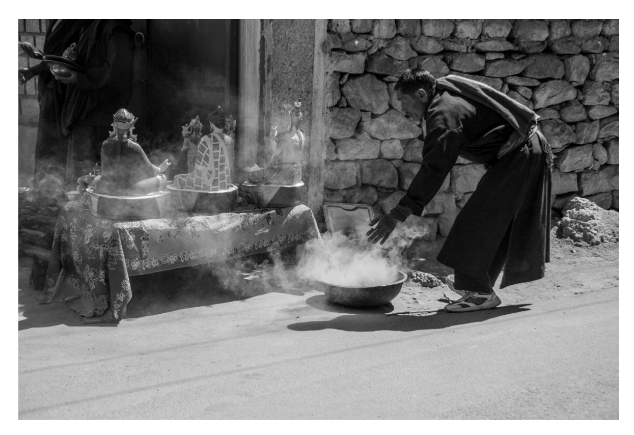
Figure 2. Consecration ceremony for statues, Sankar Gompa, Leh, Ladakh (photo E. Ferrari 2015).

Sacred images cannot be used for religious purposes without this authentication, until their internal spaces—in case of statues for example—are filled with relics, precious substances, jewels, medicinal herbs and, most importantly, written prayers (mantras or invocations) and then sealed. Ready-made images and ritual items which have been sold since the second half of the 20th century in the tourist markets of the Nepal Valley, for example, cannot therefore be regarded as 'sacred' or 'liturgical' in any traditional sense. To be considered 'sacred' by local Buddhist practitioners, images must be properly represented and consecrated.