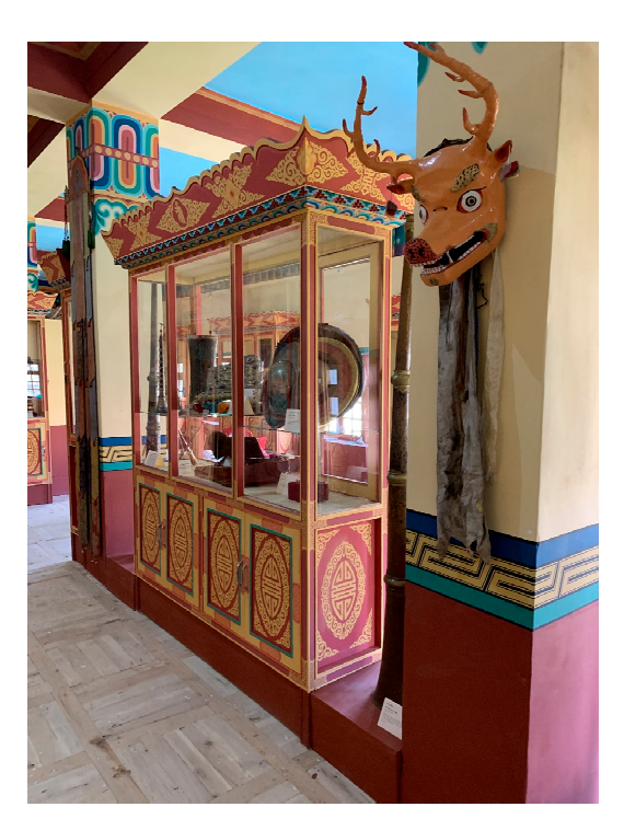
Figure 7. The new Chemde Monastery Museum, Ladakh.

This does not mean that such objects cannot retain their intended purpose, however, when placed in a museum, as can be observed from the creation of Tibetan monastery museums in the Himalayan region—specifically museums inside monastic complexes (Figure 7)—as well as Tibetan museums, such as those in Dharamsala.<sup>23</sup>