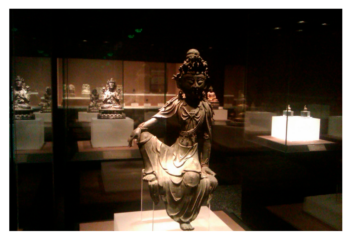
Figure 13. Bodhisattva on display in the "Selected Works of Ancient Buddhist Statues" Gallery, Capital Museum, Beijing.

upon Tibetan material. Alongside the design emphasis on aesthetics in many of China's key museums, with sculptures individualised on plinths and dramatic spot lighting (Figure 13), Tibetan artefacts have been overtly harnessed and interpreted for political ends, used, as Varutti asserts, as 'a platform for nation building' (Varutti 2014, p. 161); 'to create and disseminate specific narratives of the Chinese nation' (Varutti 2014, p. 59); and to 'provide political legitimation' (Varutti 2014, p. 90).<sup>37</sup>