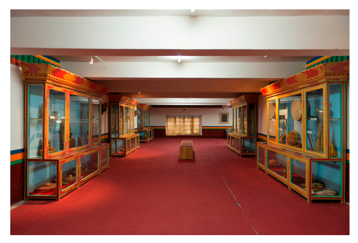
Figure 9. The Hemis Monastery Museum, Ladakh.

These monastery museums have been established for a range of reasons. Tibetan monks cite protection, security, education, as well as making money by attracting tourists, as the main motivators. Some monasteries have large and important collections, and can only fit a limited number of items onto the altars in the shrine rooms, so a high percentage of material has, historically, been stored away. As objects have been stolen in the past, there is today a growing consensus that collections would be more secure if cased and on public display. At Hemis monastery, the Twelfth Gyalwang Drukpa (b.1963)—leader of the Drukpa Kagyu sect of Tibetan Buddhism—took the decision to build a museum thereby making objects accessible and secure. A number of Tibetan monks interviewed by the authors emphasised the significance of demonstrating Buddhist heritage to outsiders, with museums becoming increasingly important for the tourist industry. Museums, thus, are intimately associated with new values emerging as a result of Westernisation. A number of monks also indicated that, for them, museums are a way to demonstrate and celebrate their individual monastery's history and identity. How, then, do the monasteries deal with the display of some of their most sacred objects in these new Western-style spaces?