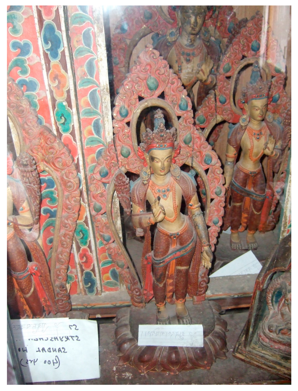
Figure 11. Shrine with wooden statues, Stakna Monastery, Ladakh.

English, with the names of the deities in Tibetan. The altars here have glass in front and thus, in a sense, blur the boundary between a sacred, active space for local Buddhists and an educational display for foreign tourists.