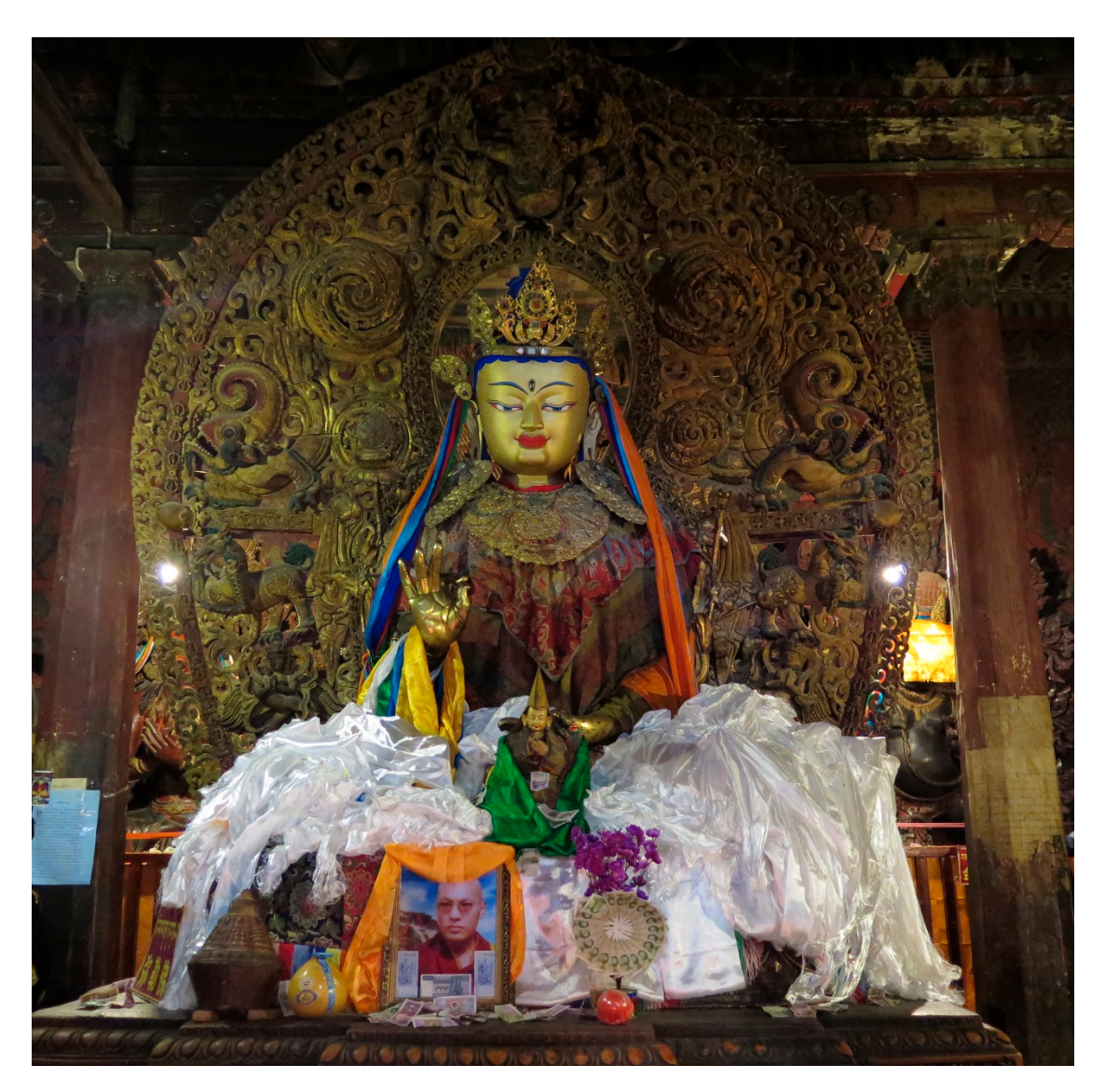
Figure 1. Silk scarfs and offerings to the statue of Maitreya, Gyantse Tsuklakhang, Tibet.

In order to fully appreciate Himalayan Buddhist art then, it is necessary to understand religious meanings and specific symbolism rather than aesthetic criteria. In addition to the spiritual meaning that the sacred image conveys, its own creation, from a Buddhist perspective, is aimed at improving one's karma and developing merit for the future. Although improving karma is possible by removing obstacles and through creating well-being, it can also be achieved, specifically, as a result of commissioning sacred objects.