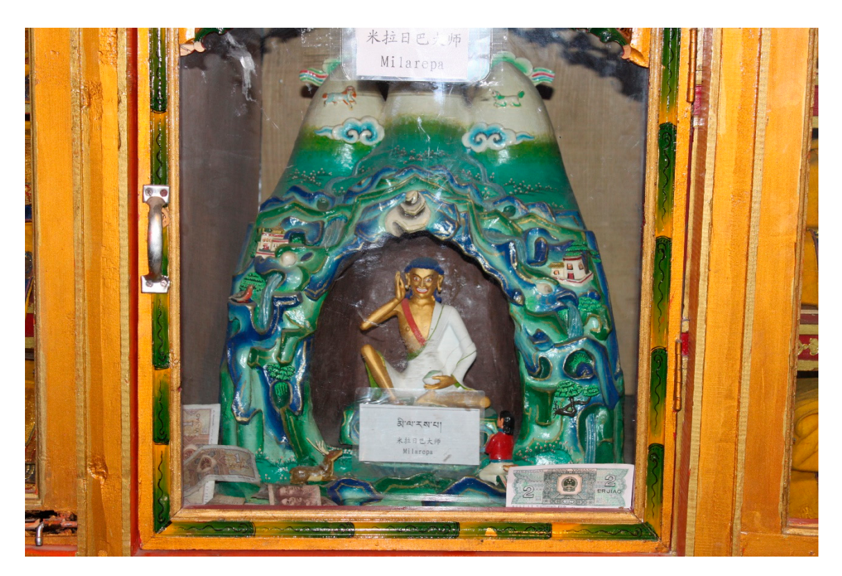
Figure 12. The saint and poet Milarepa, 20th century, clay, Drepung Monastery, Tibet (photo Bellini 2012).