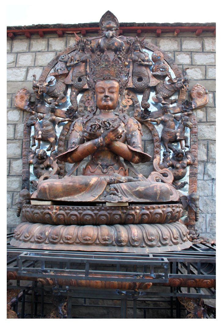
Figure 5. Unfinished Vajradhara metal statue in a Buddhist art workshop near Sera Monastery, Lhasa, Tibet.

As already described, it is necessary, after the creation of an image, to invoke the divinity or the 'descending entity' to 'reside' within it, thus guaranteeing its canonicity (Bentor 1996, p. xxi). In this respect, only lamas are entitled to decide if an image is suitable or not. A fundamental characteristic of Tibetan Buddhist art is its relevancy to specific artistic canons, realised through two main elements: iconography, namely the representation of the divinities on the basis of the ritual texts that describe them (Figure 6);<sup>11</sup> and iconometry, the codified system of proportions<sup>12</sup> for each religious class of subjects, for example, Buddhas, Bodhisattvas, and Dharmapalas.<sup>13</sup> The proportions