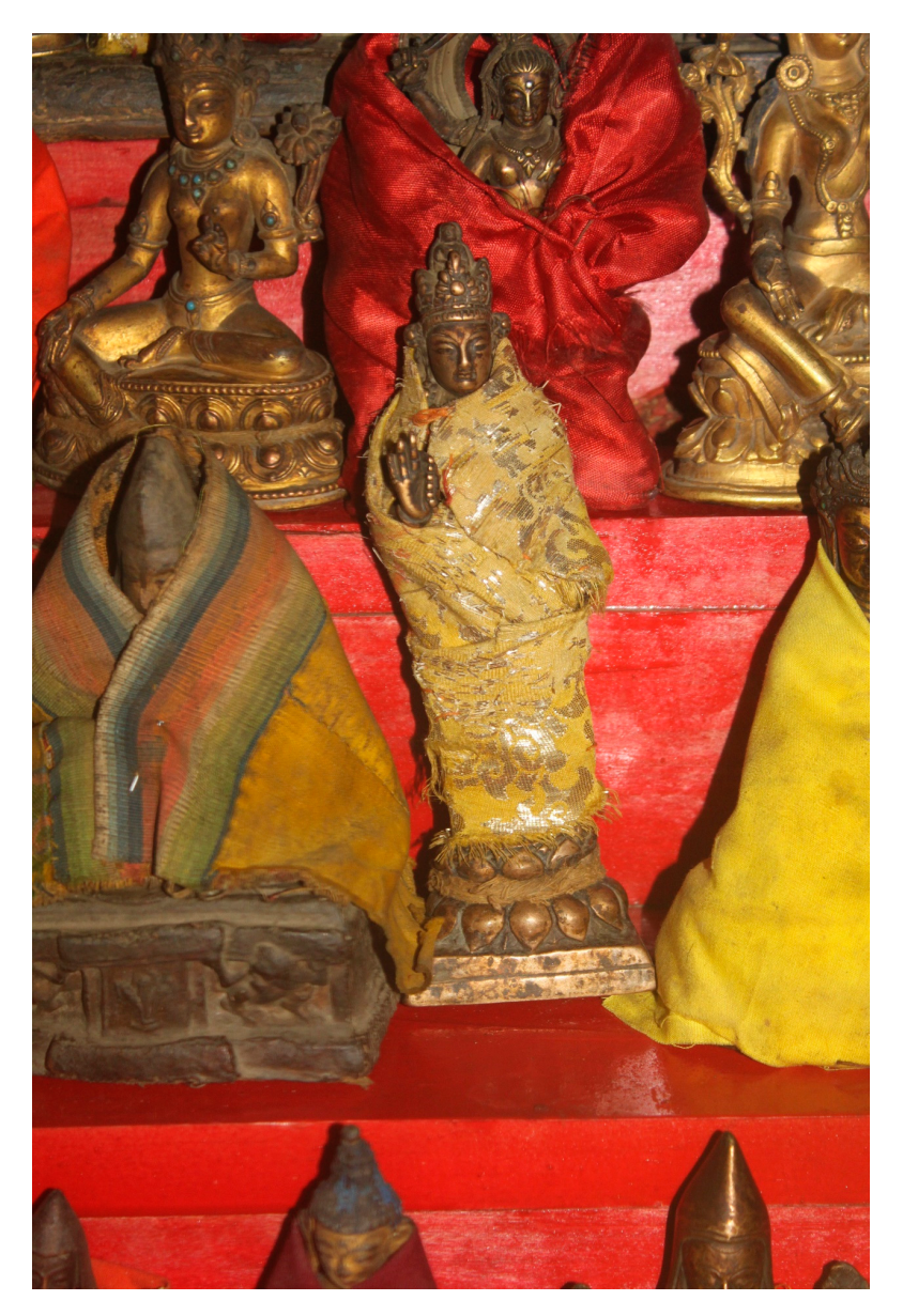
Figure 8. Shrine with statues in Karsha Gompa, Zanskar, Ladakh.

many statues, paintings and ancient objects have been stolen over recent decades (see for example Chao 2018).