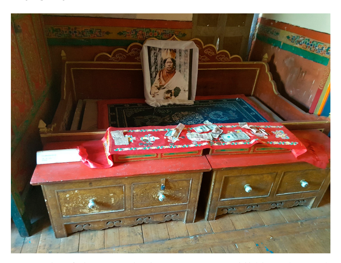
Figure 10. Photo of Taktsang Repa, Chemde Monastery Museum, Ladakh.

(stag tshang ras pa, 1574–1651). It is notable that local visitors move around the exhibition rooms in this building, regardless of the layout of the cases, in a clock-wise direction, undertaking a ritual, known as a 'kora' (skor ra)—a circumambulation performed by walking clockwise (usually around a stupa or mountain) as part of a ritual Buddhist practice. Many visitors at Chemde were observed by the authors stopping off for prayer as they processed around the displays, bowing their heads, hands held together at chest level, murmuring in front of particularly potent images. Offerings of money were left in front of certain deity statues in the museum, on Taktsang Repa's couch, and a white silk scarf (kha btags) was placed as a sign of respect and reverence over the framed photograph of a reincarnation of Taktsang Repa (Figure 10).