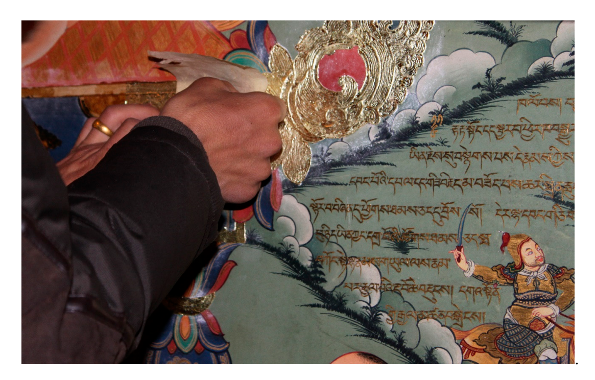
Figure 3. A painter gilding his wall painting, Ramoche Temple, Lhasa, Tibet.

artistic production has for Tibetans. The artists, in fact, are not simply creating aesthetically valuable works; they are also giving a worldly body to the Buddhist deities.