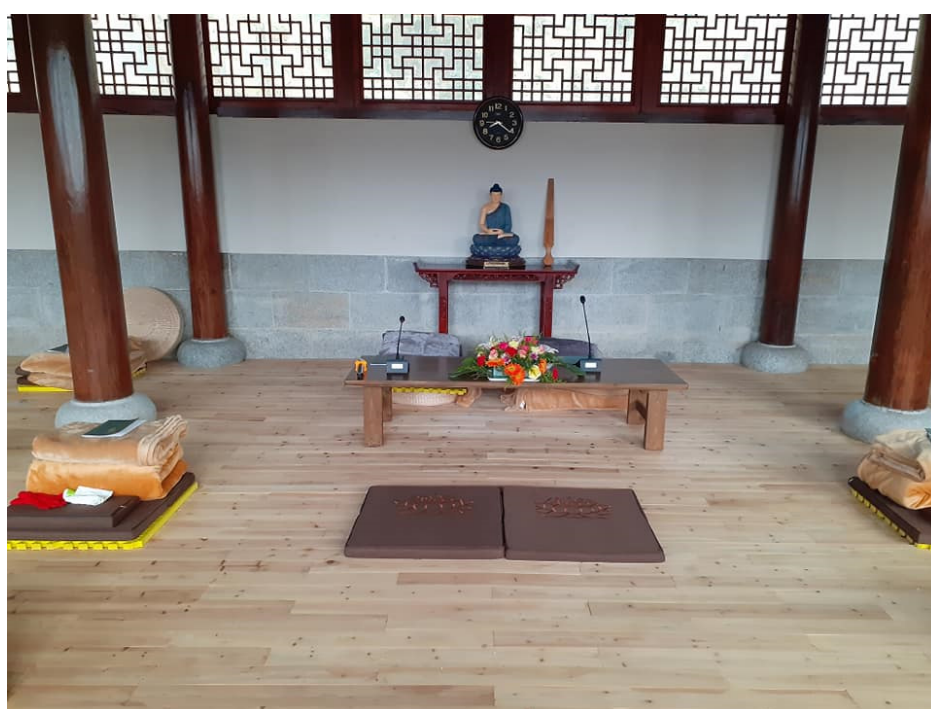
Figure 2. Fragrant sword.

On the first evening of the retreat, all participants were sitting on meditation mats quietly at the meditation hall after settling down from their long distance travel from different provinces. Wuyou and Jiewen, the two monastic teachers, dressed in Chinese Buddhist monastic robes and pairs of eyeglasses, 23 were sitting in the middle facing all participants. Behind them was a very small Sakyamunī Buddha statue in modern style and a piece of “fragrant sword” ( xiangban 香板), a common symbolic instrument for keeping discipline at Chan hall (Figure 2). 24 Unlike the traditional Chinese Chan hall in square size, this meditation hall is designed as a long rectangle with meditation mats on the floor. The setting emulates those halls in Theravāda tradition. Three monks, two male volunteer Dhamma workers ( fagong 法工), and 10 male participants were sitting on the right wing of the hall. A nun, two female Dhamma workers, and 24 female participants were sitting on the left wing of the hall. All teachers and participants were Han Chinese.