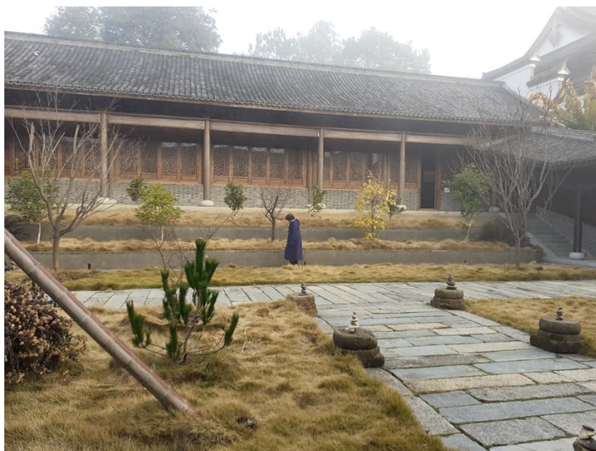
Figure 3. Walking meditation.

maintain mindfulness practice and further improve psychological functioning for reducing negative emotions (Gotink et al. 2016).