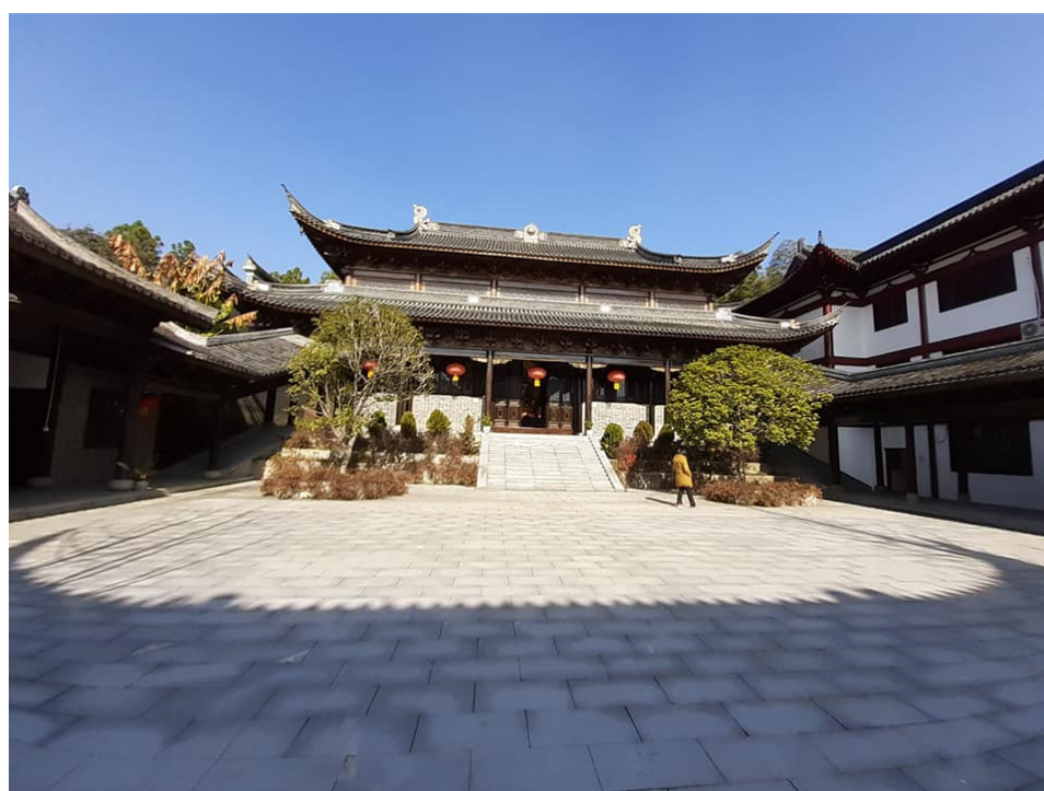
Figure 4. Architecture style.

intertwined in the retreat. Participants could freely ask questions clarifying their doubts of practice, share their experiences, and even express their emotions and tears publicly after each teaching session. Both monastic teachers gave responses clearly with positive acknowledgement to each of them one by one. A client-centered counselling approach was explicitly practiced in group interviews and individual interviews to allow the participants to speak out about their own experiences and challenges of practices. In the late modern context, Kim Knott (2016, p. 41) argues that more people choose to “turn to the self” and individualize their religious experiences. As explained by McMahan (2008), Taylor used the term “massive subjective turn” to refer to a “new kind of selfhood, constituted by increased self-reflexivity” with the rise of Romantic, psychological, and rationalist influence since the nineteenth century (p. 188). One’s own experience has become an explicit object of reflection and self-awareness. McMahan uses the term “subjective turn” to examine the trend of detraditionalization and privatization of Buddhist meditation after the encounter with Western modernity (pp. 183–92).