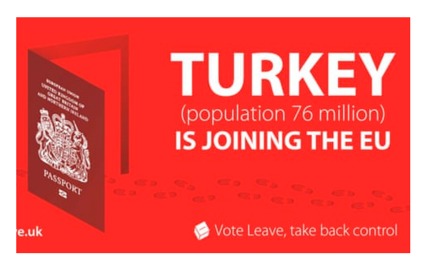
Figure 1. On 22 May, Vote Leave published a poster of an open door fashioned from a passport with footsteps walking through it and the tagline 'Turkey (Population Seventy-Six Million) is Joining the EU'—one that was also re-used on social media platforms right up until the day of the referendum (Bale 2022).