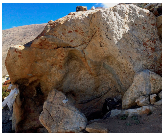
Figure 3. The body-imprints of Guru Rinpoché and his consorts.

At the top of the pass is a large cairn ( lab rtse ) with many strings of prayer flags connecting the bundle of sticks and juniper branches with the surrounding peaks and boulders. Nothing was said about this monument. The three large rock columns surrounding the cairn are said to be like the three legs of the tripod of a local cooking stove. A large boulder just down the slope was said to be a copper cooking vessel that was used by the Buddha Śākyamuni and his entourage when they prepared food for a tantric worship gathering ( tshogs mchod ) here. This is one of two appearances of Śākyamuni at this pilgrimage site. About an hour further on there is a very large boulder with three deep indentations that are said to be the bodily imprints ( sku rjes ) of Guru Rinpoche and his consorts, Khandro Yeshe Tsogyel ( mkha' 'gro ye shes mtsho rgyal ) and princess Mandāravā, (Figure 3) who came here to welcome and encourage Chöjé Shelgampa. They gave him Dharma teachings and tantric empowerments, and showed him the way to continue.