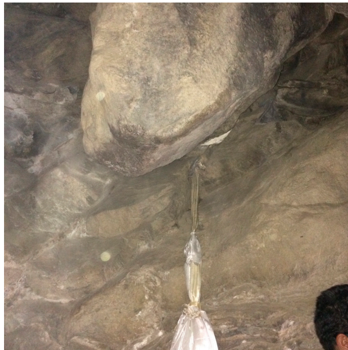
Figure 12. The phallus of Khorlo Dampa.

Finally, one reaches the center, Yeshé Gönpö Cave. “Yeshé Gönpö” is another name for Mahākāla, and the Drukpa lineage generally emphasizes the four-armed form of this protector and yidam. This is a very large and well-appointed cave, with a wooden floor and central altar (Figure 13). When a large group of people do the pilgrimage in May/June led by Somang Rinpoché, he leads the puja and feast offering in this space. Just inside the door is a small stove, that conceals a self-arisen letter “āḥ” on the floor. This was placed here to prevent people from stepping on the image. In the ceiling of the cave is the self-arisen face of Yeshé Gönpö (Figure 14).