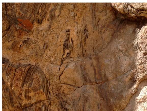
Figure 4. Image of the Brahmin couple on the rock surface.

The spring known as tsechu ( tshes bcu ) is the last site before arriving at Saurāṭa né. Guru Rinpoche created a spring here for Chöjé Shelgumpa, who, when he drank this water, became so happy that he said it was like the feast offering ( tshog mchod , Sanskrit: gaṇa pūja ) celebration on the tenth day of the lunar month in honor of Guru Rinpoché, thus this is what this spring is called. This site is more elaborate than the previous spring, with mantras of Guru Rinpoché painted and carved on the large boulder, khataks tied around the tree, and prayer flags decked across the site. The spring itself, however, was not flowing. There was a plastic soda bottle propped up where the water should have been coming, but there was no stream and the bottle was empty.