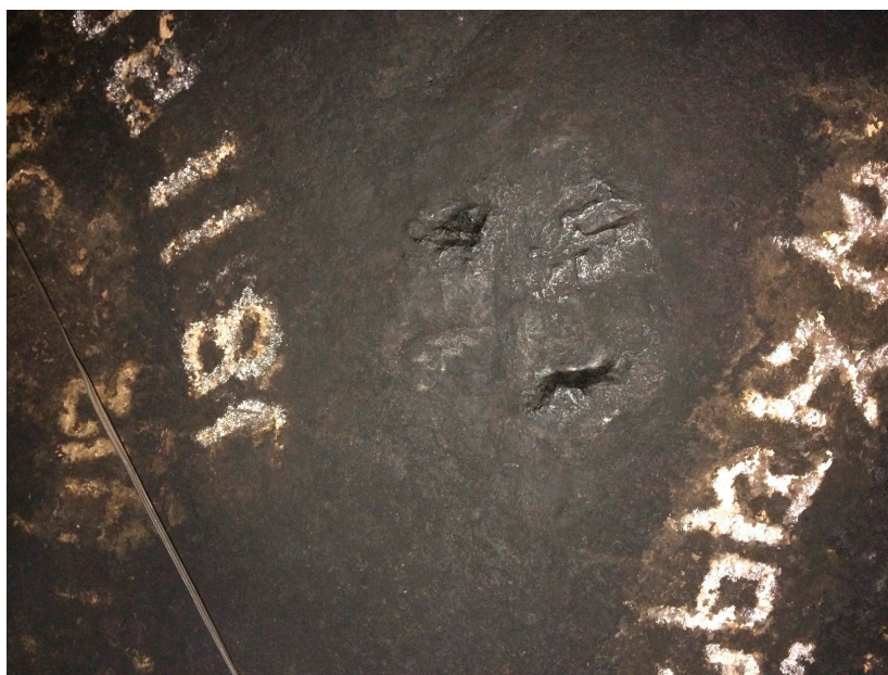
Figure 14. The face of Yeshe Gönpo.