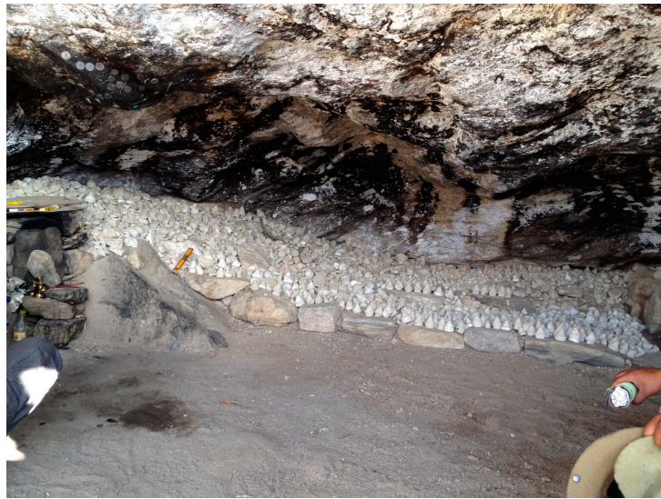
Figure 9. Tsa-tsas in Jakhyung cave.