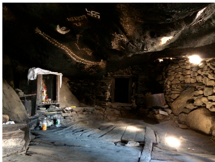
Figure 13. Yeshé Gönpö Cave.

Finally, one reaches the center, Yeshé Gönpö Cave. “Yeshé Gönpö” is another name for Mahākāla, and the Drukpa lineage generally emphasizes the four-armed form of this protector and yidam. This is a very large and well-appointed cave, with a wooden floor and central altar (Figure 13). When a large group of people do the pilgrimage in May/June led by Somang Rinpoché, he leads the puja and feast offering in this space. Just inside the door is a small stove, that conceals a self-arisen letter “āḥ” on the floor. This was placed here to prevent people from stepping on the image. In the ceiling of the cave is the self-arisen face of Yeshé Gönpö (Figure 14).