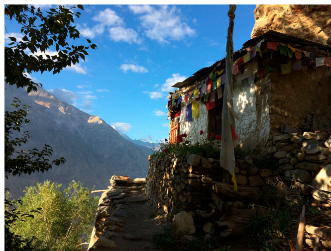
Figure 7. The Shrine Room.

Up a level, and further on than the caretaker's quarters is the shrine room that seemed to serve as the focal point of regular worship at the site (Figure 7). The caretaker filled the water bowls and lit the oil lamps daily, and the room was well-maintained. It seemed however, that there was not always a caretaker present, as we had to wait for several weeks to do the pilgrimage for the caretaker to return to Saurāṭa from his home in Nako. In a windowed vestibule, there is a small rock ledge with oil lamps, and numerous coins pressed on the rock wall above. The stucco-like wall of the vestibule was said to be the result of Chöjé Shelgumpa blowing his nose in his hand and flinging it out the door of the shrine, creating the rough surface of the wall. Entering the tiny doorway one comes to the shrine itself, which hold five or six people. The central image is an eleven-headed, thousand-eyed Chenrezik ( spyān ras gzigs , Sanskrit: Avalokiteśvara ). In front of it are a few smaller images, including a Guru Rinpoché, and photos of the current and previous Somang Rinpochés. This is the incarnation lineage associated with the site. Up on a cabinet to the left of the main image was a large book in very poor condition and several others. On a small puja table near the window was a book that was said to be the original of the pilgrimage guidebook ( gnas yig ) of Saurāṭa. The text in the appendix here is the translation of the transcribed text done by Lama Ngawang Negi.