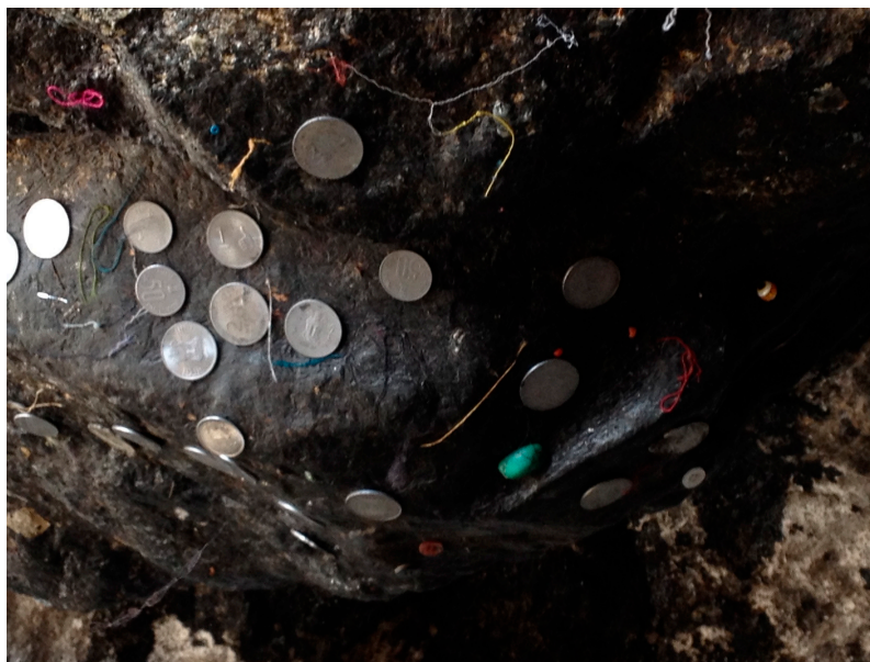
Figure 10. Coins affixed to Jakhyung's head.