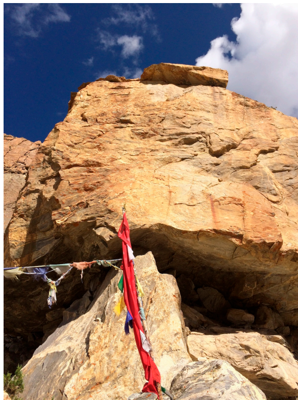
Figure 11. The palace of Yama Rāja and the menstrual blood of the khandroma.

The next cave is Drölma Cave. One day while Chöjé Shelgompa was living in his residence, he heard a man's voice coming from the cave below while he was meditating. Going to investigate, he looked into the cave and saw the twenty-one Tārās dancing in a circle around Khorlo Dampa. Upon being seen, Khorlo Dampa flew up into the rock of the ceiling, blessing the rock and leaving a self-arisen image of his "secret part," i.e., his phallus (Figure 12). The twenty-one Tārās dissolved into walls of the cave. Women who are unable to conceive come to this place to become fertile, and the cave is said to bestow blessings on all who come there. Just inside the door is a broom with which to sweep the dirt of the floor as one leaves. The next person who enters looks at the floor, and if she is lucky, she will see footprints of khandromas in the dirt. One of my informants noted that earlier, the sightings of the footprints was quite common, but more recently it was becoming less so. At the rear of the cave is a small passage between an upper and lower boulder. It is said that if one is without sin, he or she will be able to squeeze through the space. A sinful person will not be able to pass through.