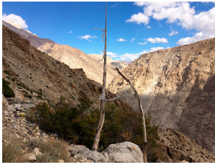
Figure 6. View from Saurāṭa across the Sutlej river gorge. The Chinese border is on the ridge.

Up a level, and further on than the caretaker's quarters is the shrine room that seemed to serve as the focal point of regular worship at the site (Figure 7). The caretaker filled the water bowls and lit the oil lamps daily, and the room was well-maintained. It seemed however, that there was not always a caretaker present, as we had to wait for several weeks to do the pilgrimage for the caretaker to return to Saurāṭa from his home in Nako. In a windowed vestibule, there is a small rock ledge with oil lamps, and numerous coins pressed on the rock wall above. The stucco-like wall of the vestibule was said to be the result of Chöjé Shelgumpa blowing his nose in his hand and flinging it out the door of the shrine, creating the rough surface of the wall. Entering the tiny doorway one comes to the shrine itself, which hold five or six people. The central image is an eleven-headed, thousand-eyed Chenrezik ( spyān ras gzigs , Sanskrit: Avalokiteśvara ). In front of it are a few smaller images, including a Guru Rinpoché, and photos of the current and previous Somang Rinpochés. This is the incarnation lineage associated with the site. Up on a cabinet to the left of the main image was a large book in very poor condition and several others. On a small puja table near the window was a book that was said to be the original of the pilgrimage guidebook ( gnas yig ) of Saurāṭa. The text in the appendix here is the translation of the transcribed text done by Lama Ngawang Negi.