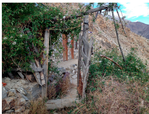
Figure 5. Entrance gate to the circuit of the five caves.

Finally arriving at the heart of Saurāṭa eleven hours after departing the village, one enters through a rough wooden gateway surrounded by lush greenery studded with small dandelion-like flowers (Figure 5). The site is a short distance up the valley from the confluence of the Sutlej and Spiti rivers, directly across the Sutlej gorge from Shipki pass, which is the border between India and China and is now controlled by the Chinese military (Figure 6). The space is situated on a steep hillside, with several levels of flat ground on which the structures sit. On the level where one enters is a three-room guesthouse and the caretaker's quarters. The caretaker's quarters consisted of a fairly large room with a stove and sitting and sleeping space. Behind this room was a cave, which is one of the five main caves of the né. At first sight the cave seemed to be no more than a storage area, with several car batteries, and numerous other practical things piled up, though there were several khataks draped across the space, including one hanging from a spot in the rock ceiling. It was only later that we learned that this was one of the caves of the né circuit.