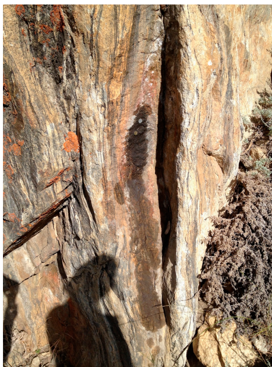
Figure 8. The khandroma's vulva.