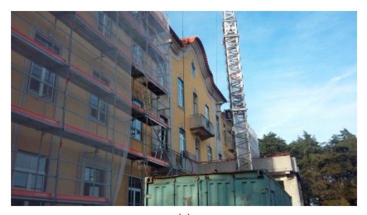
Figure 2. Cont.