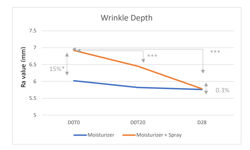
Figure 1. Change in wrinkle depth (PRIMOS Ra value, mm). * p < 0.05; *** p < 0.001.

* p < 0.05; *** p < 0.001. DOT0 = baseline, DOT20 = after 20 min after first application, and D28 = after 28 days.