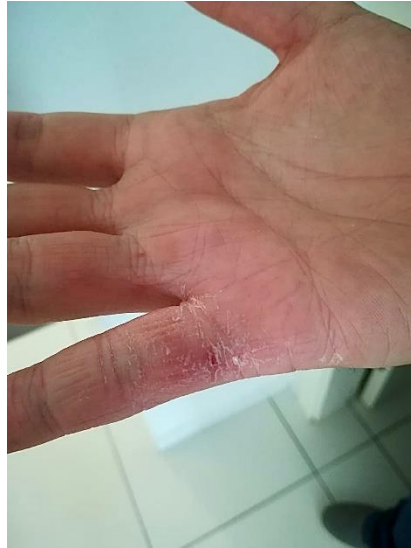
Figure 2. Clinical finding of work-related hand eczema.

perivascular infiltrate, edema of the dermis, and epidermal spongiosis and exocytosis are observed. Chronic allergic contact dermatitis is also diagnosed based on a detailed clinical picture and patient history, and it is confirmed with a positive patch test result.