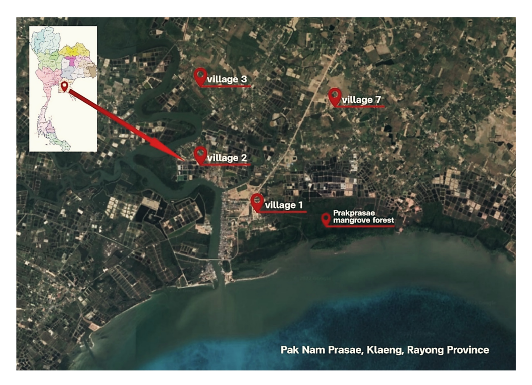
Figure 2. Study area.

mangrove forest area and to conserve the mangrove forest situated in the Pakprasae subdistrict [14] (see Figure 2). The total area of the Prakprasae mangrove forest is 9.6 km<sup>2</sup>. The project also intended to release 10,000 young fish within the project area to recover the mangrove ecosystem. Most importantly, ecotourism in the area has also been promoted by several activities, such as sustainable production of local products, planting mangrove trees, sightseeing mangrove forest scenery, etc. Four local communities (Villages 1, 2, 3, and 7) are situated adjacent to the Prakprasae mangrove forest area and are targeted by this CSR project for livelihood and well-being improvement. These communities included 3133 people [95]. These people have been encouraged to participate in the CPF GSPMF project since 2014.