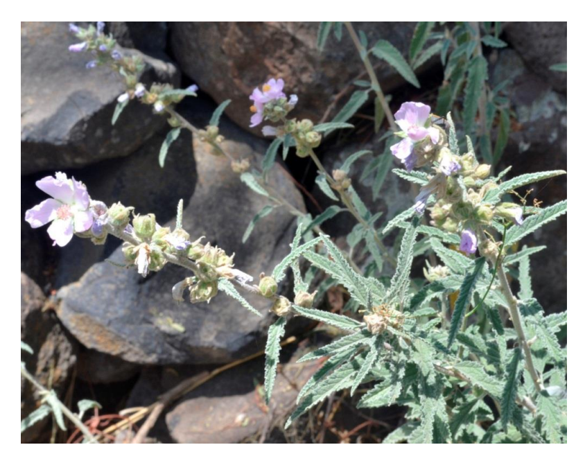
Figure 1. Sphaeralcea angustifolia wild plant growing in the municipality of Huichapan, Hidalgo State, Mexico.

Based on ethnobotanical information from herbariums and scientific literature [3–7], a succinct botanical description of S. angustifolia was determined by Cavanilles and G. Don (Malvaceae). The herbaceous plant reaches up to 1.5 m high, grows erect with narrowly lanceolate leaves, and has racemose inflorescences with purple or pinkish-whitish petals, and the androecium is usually purple. The scientific name of the species is associated with the morphological characteristics it presents, etymologically derived from the Greek sphaero (globe) and alcea (mauve), the specific epithet angustifolia refers to its narrowly lanceolate leaves (Figure 1).