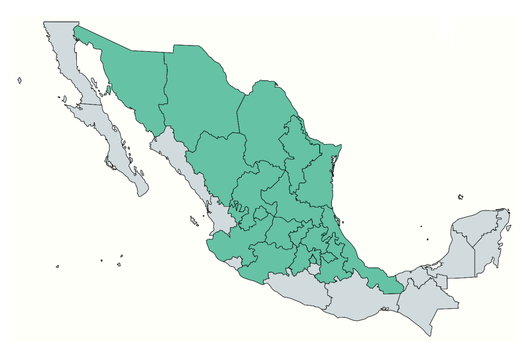
Figure 2. Geographical distribution of Sphaeralcea angustifolia species in Mexico.

a mixture of S. angustifolia with Matricaria recutita (L.) Fiori, Buddleja scordioides Kunth, and mint is also employed [9–11]. Although oral use of the plant to treat conditions that affect the gastrointestinal tract is frequent, the ethnobotanical information on the curative medicinal property attributed to "vara de San José" is mainly linked to the widespread topical use of the species to treat inflammatory processes and associated ailments. Thus, fresh leaves macerated in oil or fat are used in cases of bumps, cracks, and kinks. To reduce inflammation of angina, to combat rheumatism and bone pain, the leaves are fried in fat before covering the affected region with the preparation. The decoction of the plant or mixed with "arnica" ( Heterotheca inuloides Cass) and "hierba del golpe" ( Lopezia racemosa Cav.) is mentioned to wash wounds and strokes. In the states of Aguascalientes, Durango, and Guanajuato, its use is reported in cases of pain [9–11].