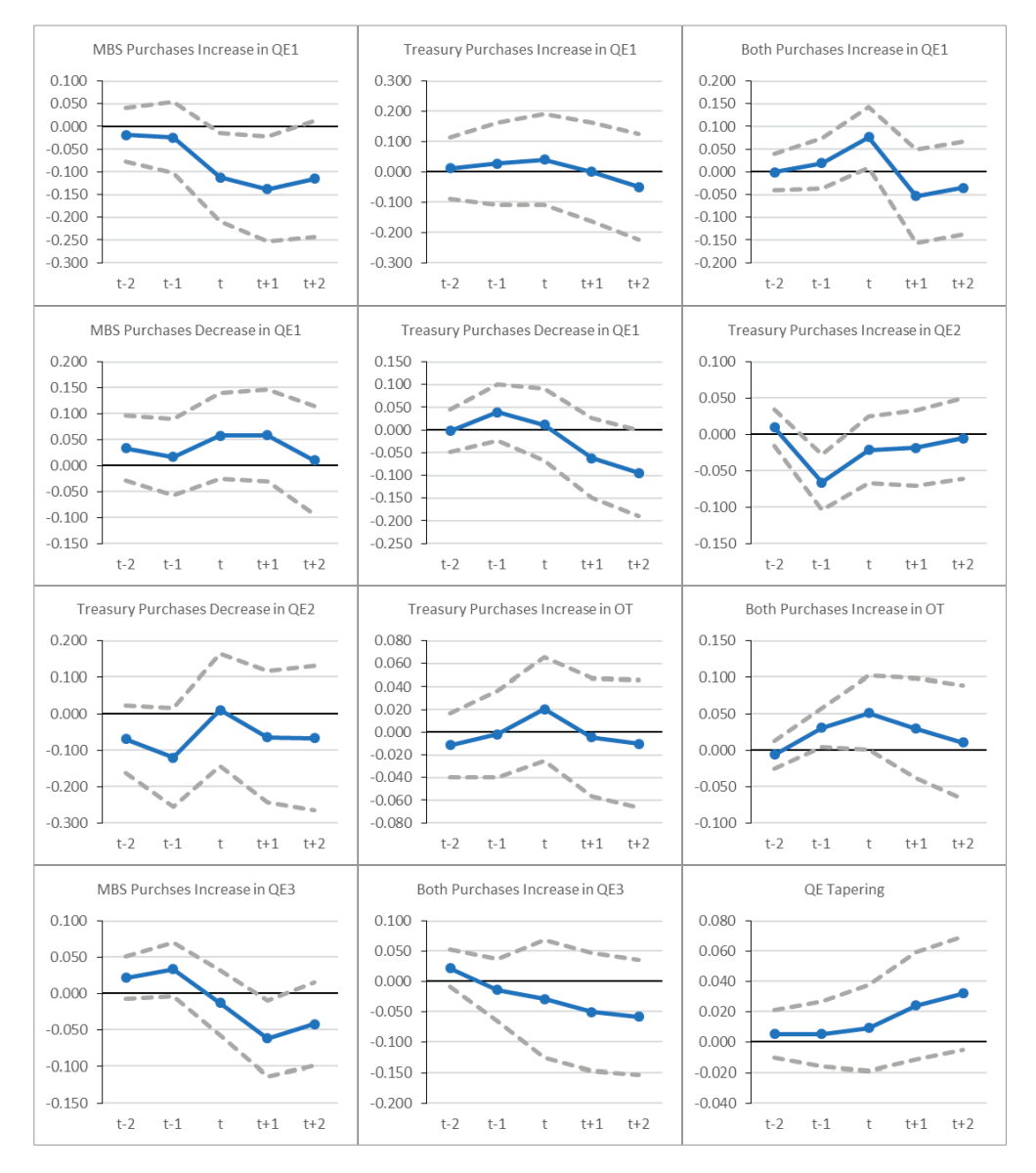
Figure 2. Cont.

To see how the mortgage rate, the Treasury rate and the spread moved on each day in a 5-day event window of grouped events, the evolutions of CARs in a 5-day event window are shown in Figure 2.