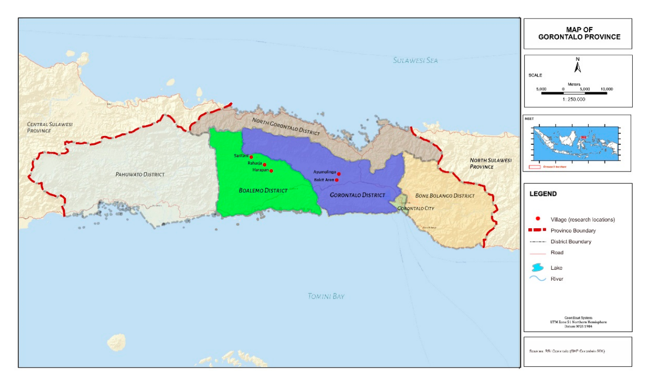
Figure 2. Location of five villages as research site in Boalemo and Gorontalo district map of Gorontalo province, Indonesia.

Gorontalo and Boalemo Districts, as the location of this research, are two regional government areas in Gorontalo Province. Based on the geographical position shown in Figure 2, it is explained that Boalemo District in the north is bordered by North Gorontalo District, in the south by Tomini Bay, in the west by Pohuwato District and in the east by Gorontalo District.