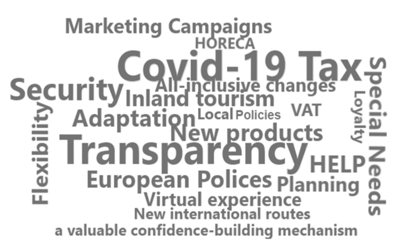
Figure 3. Word cloud.