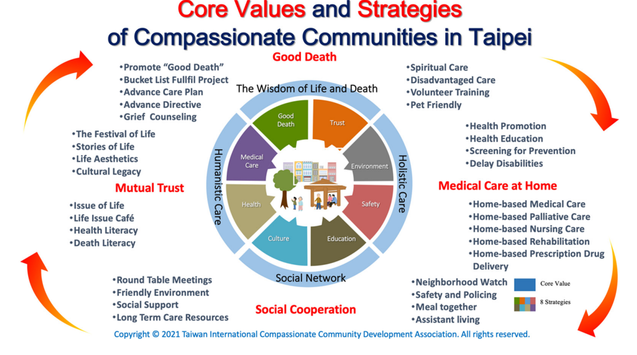
Figure 1. Core values and strategies of compassionate communities in Taipei.

By pursuing the components of the International Compassionate City Charter (i.e., public education, community development, health promotion, participatory action, and social ecology), we solidified the core value of the Shilin Old Street CC and formed strategies that suit the reality (Figure 1). We aimed to build a culturally sensitive, sustainable, and holistic CC program by integrating municipal hospital, social, and other services and collaborating with community leaders, NGOs, university students, and volunteers. Innovative programs (such as workshops, conferences, and the Life Issue Café) were presented to enable engagement, public education, and leadership. Furthermore, we organized exhibitions of life aesthetics to raise community awareness of end-of-life issues and explained the evolution of end-of-life care. The four strategies: humanistic care, social network, holistic care, life wisdom, are explained as follows.