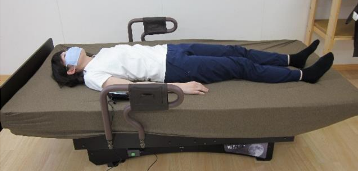
Figure 1. An electric sway bed (dimensions: 1900 \times 900 \times 500 mm (length × width × height)), powered by an electric motor, with seven sway speed settings. The motorized device was set to sway the student vertically by \pm 2 cm for a total of 4 cm. In this study, the level 2 (0.64 Hz) sway speed was used.