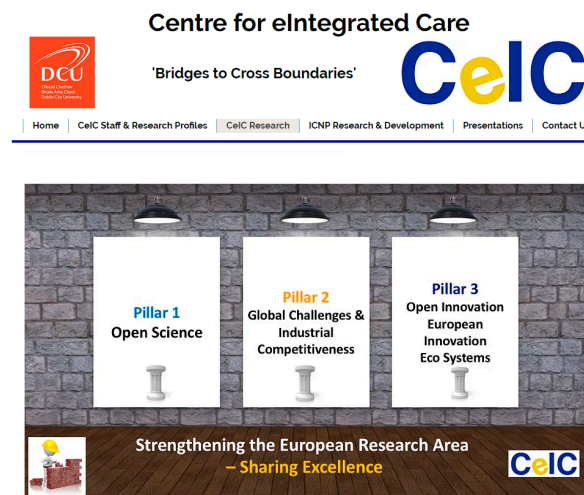
Figure 2. Screen shot of revised CeIC website.

and Industrial Competitiveness and pillar three Open Innovation. This structure provides signposting and transparency to publish research activity and grey literature as it emerges using the embracing open science agenda as defined by the European Union optimising knowledge transfer. CeIC are advancing innovation networks through dedicated workshops and disseminating material via virtual infrastructures such as CeIC website [1]. Our goal is to provide transparency, nurture creativity and advance public private research by creating scholarly knowledge clusters and knowledge assets to advance open science. Thus, supporting and building greater capacity where it is most needed to address the challenges ahead. Figure 2 provides a screen shot of the CeIC website.