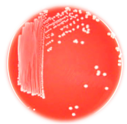
Figure 1. P. multocida B:2 colony on 5% (v/v) sheep-blood agar. The colony was observed after overnight incubation at 37 °C (unpublished data).

Therefore, lower costs for cultivation, as well as for scaling up, are important in vaccine manufacturing. The efficient development of a vaccine, especially in terms of