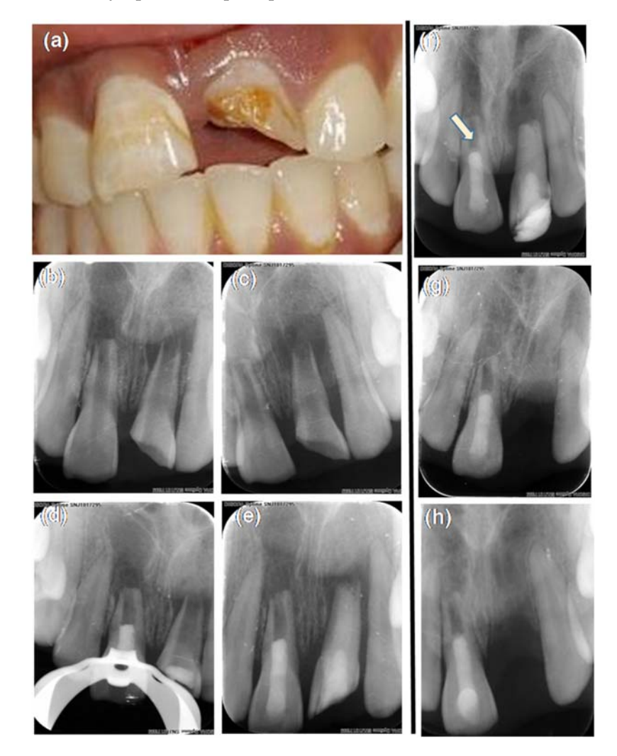
Figure 1. Intraoral periapical radiograph (IOPA) images of preoperative and a three-year follow up of REP in 11. ( a ) pre-operative photograph of maxillary central and lateral incisors; ( b , c ) pre-operative IOPA of teeth 11 and 21; ( d ) IOPA showing a coronal seal after placement of HAM in 11; ( e ) immediate postoperative IOPA of 11; ( f ) IOPA at a three-month follow up. The arrow is pointing to the calcific barrier above the Biodentine; ( g ) 19 month follow up IOPA; ( h ) three-year follow up IOPA.

the axial section measured 1.2 mm labially, 0.8 mm mesially, 0.8 mm lingually, and 0.8 mm distally, respectively (Figure 2a,b). The volume of periapical lesion was measured using a Volux–Horos viewer for Mac (V2.0.2, Nimble Co., LLC d/p/a Purview, Annapolis, MD, USA), and a CBCT periapical index (CBCTPAI) score of 5D was assigned to tooth #11 (Figure 2f,h,j,l). A diagnosis of an immature tooth with pulp necrosis and asymptomatic apical periodontitis in relation to tooth #11 arrived.