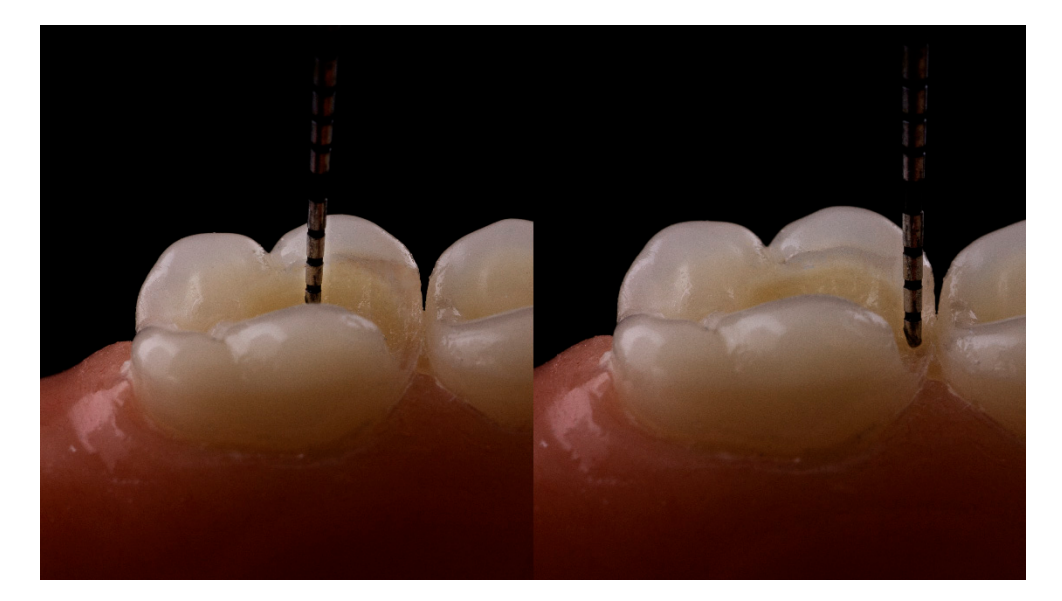
Figure 1. The distance between the cusp tip to pulp chamber ceiling, measured with a graduated probe.

Cavities were prepared with turbine burs (NTI-Kahla GmbH Rotary Dental Instruments, Kahla, Germany) under water-cooling. The selective etching of enamel with 37% phosphoric acid and application of the bonding agent Prime and bond NT (Dentsply) was conducted after the disinfection of prepared cavities with 1% chlorhexidine. One cavity was restored with nano-ceramic composite Ceram • X mono . The second cavity was restored with flowable bulk-fill material SDR with normal viscosity composite. Occlusal adjustment was made with Arkansas abrasive stones (NTI-Kahla GmbH Rotary Dental Instruments), polishing with the Enhance Finishing and PoGo Polishing systems (Dentsply).