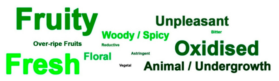
Figure 2. Word cloud of the descriptors elicited by the white wines considered to be organic (SB2016, VB2015, CC2013).

The responses given in the guess session may be considered as the psychological construct of a wine supposed to be organic wine by trained and knowledgeable tasters. Gathering the flavour descriptions and the emotional responses for white (Figure 2) and red wines (Figure 3) in a word cloud (font size according to frequency of occurrence) it becomes evident what may be regarded as the flavour and emotional profile expected to characterize organic wines for an experienced cohort.