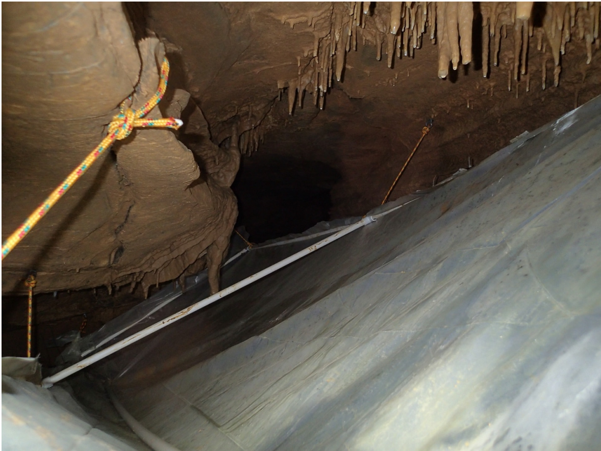
Figure S2. Photo of drip tarp set-up at MS2.