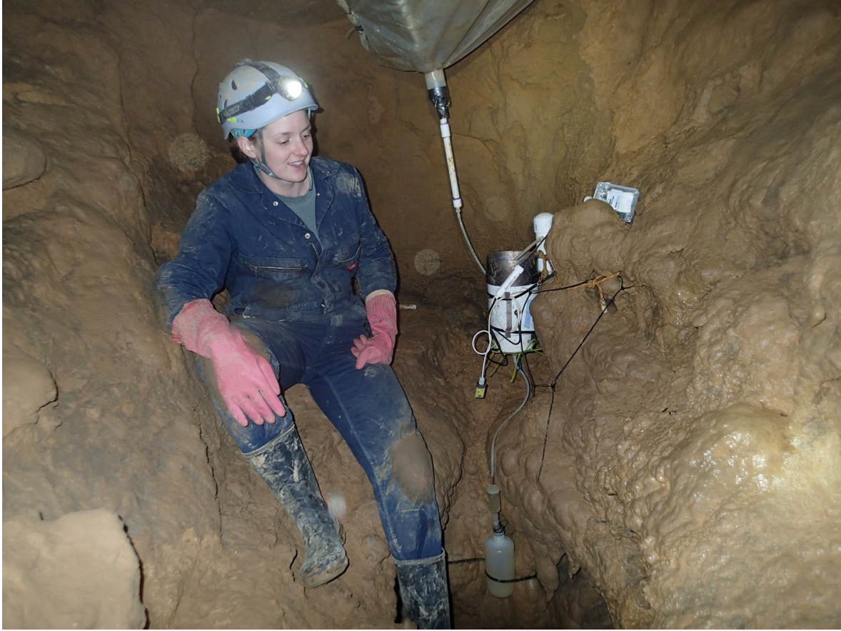
Figure S3. Photo of rain gain gauge recording drips channeled from drip tarp.