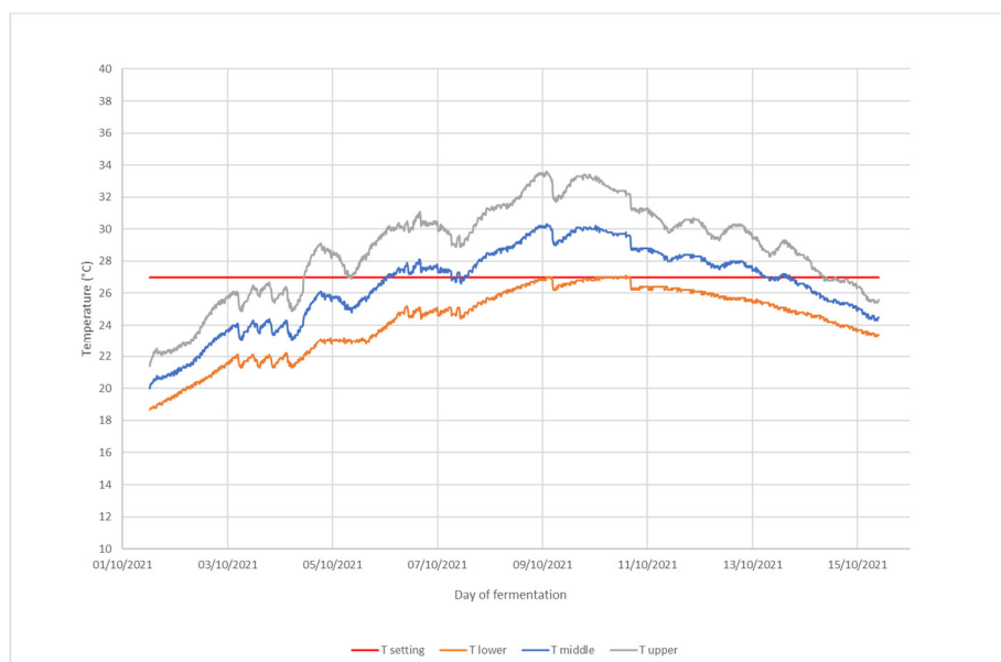
Figure S2. Temperature kinetics of three sensors of the ADCF vessel during fermentation, sensors located in the lower, middle and upper part of the vessel.