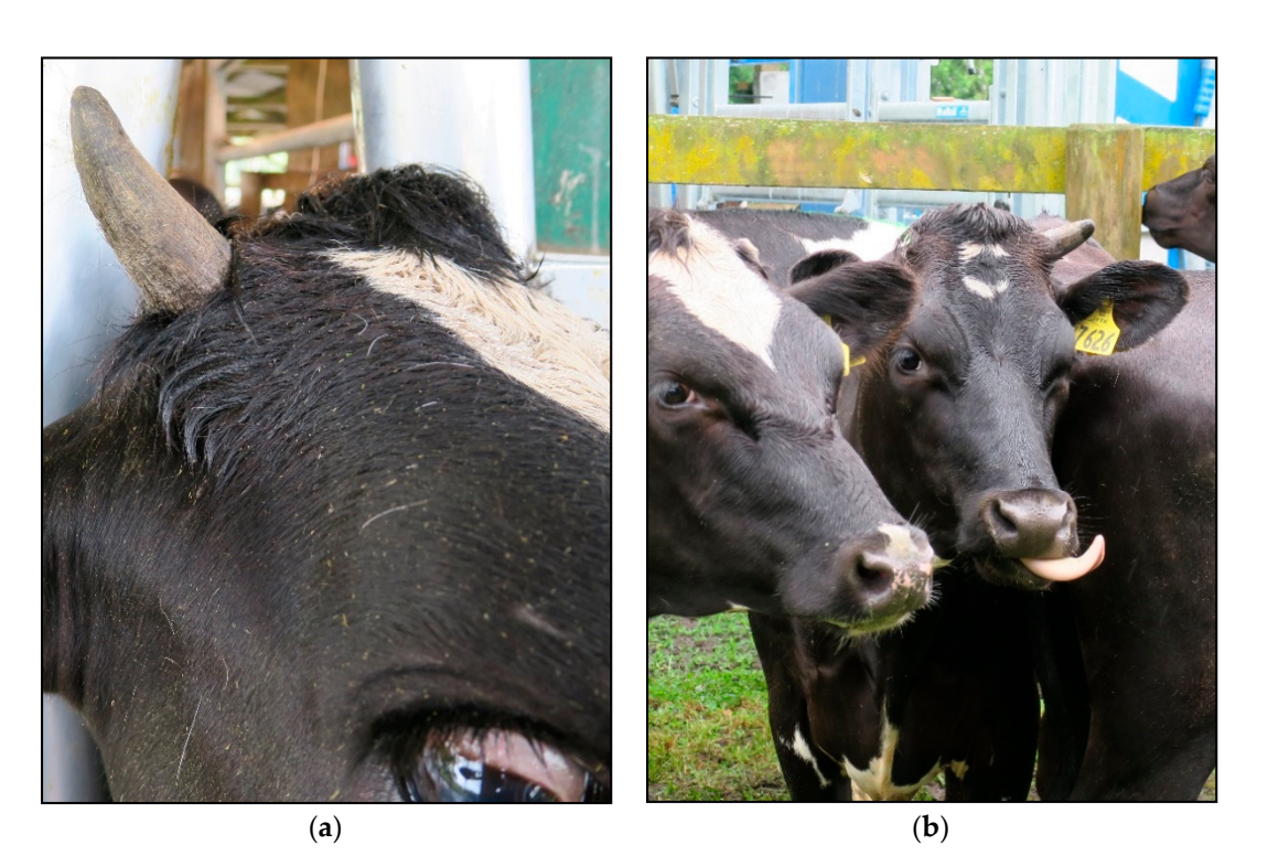
Figure 1. Image ( a ) is a picture of a normally developed horn that was not disbudded and ( b ) is a picture of a scur that developed after clove oil was injected subcutaneously under the horn bud at approximately 4 days of age.

The cross-section of a normally developed, non-disbudded (untreated) horn consisted of an outer layer of cornual epidermis, followed by a dermal layer, a fibrous tissue layer and a cornual diverticulum (Figure 2a). The internal characteristics of the scurs from CLOV treated buds, that looked like a normally developed horn but were not attached to the skull, were similar to the normal horn but did not have a cornual diverticulum (Figure 2b) and this was also similar for scurs from CLOV treated buds that looked like small deformed horns (Figure 2c).