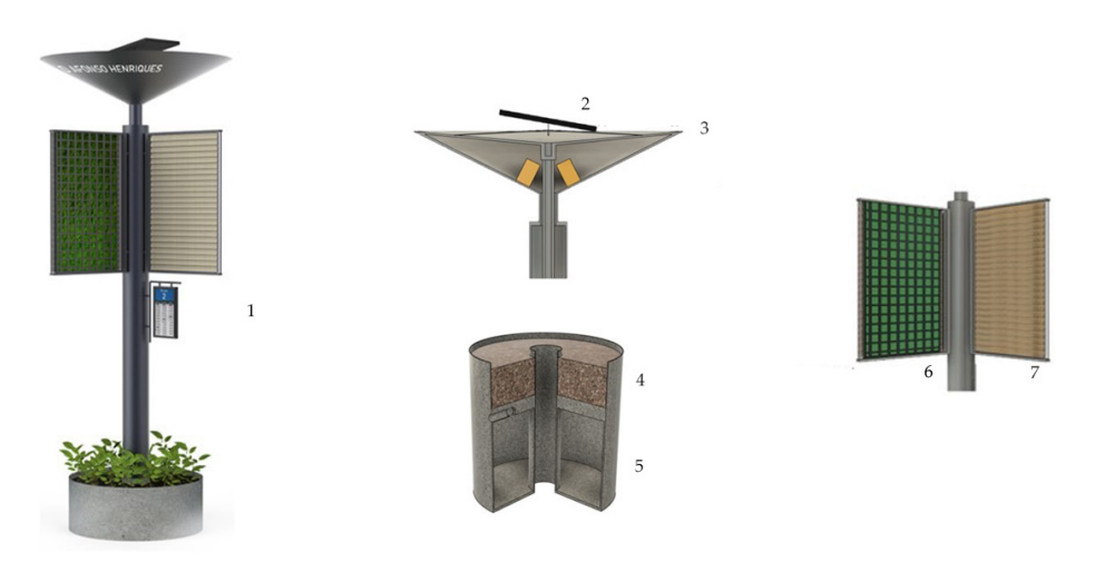
Figure 3. The biodevice to be placed at a bus stop (1) with electronic sensors and dimensions of 3 m high and 1.13 m area at the base with autochthonous shrubs. (2) Photovoltaic panel; (3) water collector; (4) soil container; (5) water reservoir; (6) autochthonous moss; (7) shading blind.