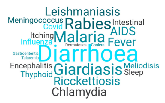
Figure 1. Word cloud of the main occurrences recorded.

The most common category of references explores the relationship between backpackers and health, often framing backpackers as a population at risk. This question appears in many studies on the incidence of diseases affecting tourists. The word cloud shown here (Figure 1) reflects the frequency of references related to various diseases. The most frequently mentioned (13 times) is traveller's diarrhoea (turista), but there are also numerous studies on parasitic infections (6), malaria (5), sexually transmitted infections (STIs) (4), rabies, and hepatitis (3).